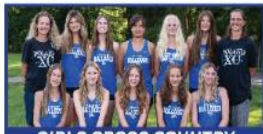
GIRLS CROSS COUNTRY