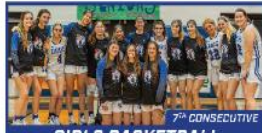
7 th CONSECUTIVE GIRLS BASKETBALL