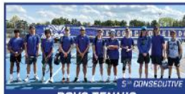
5 th CONSECUTIVE BOYS TENNIS

2024 BRUCE BROWN AWARD OF EXCELLENCE PSHS ATHLETICS