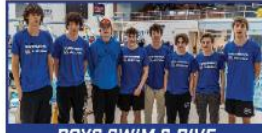
BOYS SWIM & DIVE