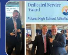
Dedicated Service Award Poland High School Athletics