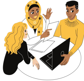
Tier One Curriculum Map and Alignment