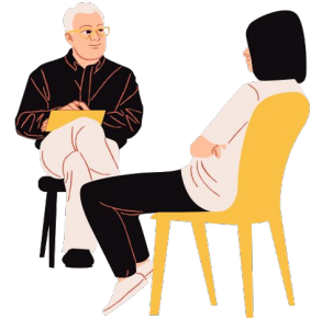
Staff First - Culture and Engagement