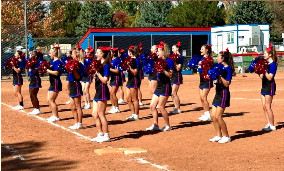
Softball wrapped up their 2024 campaign with an impressive 11-1 victory over Battle Mountain on Senior Day! Shout-out to Cheer for stopping by to support our team!