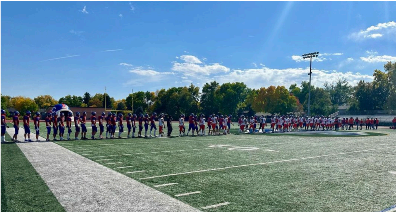
Football got back on the winning track with a 40-0 home league victory over Gateway!