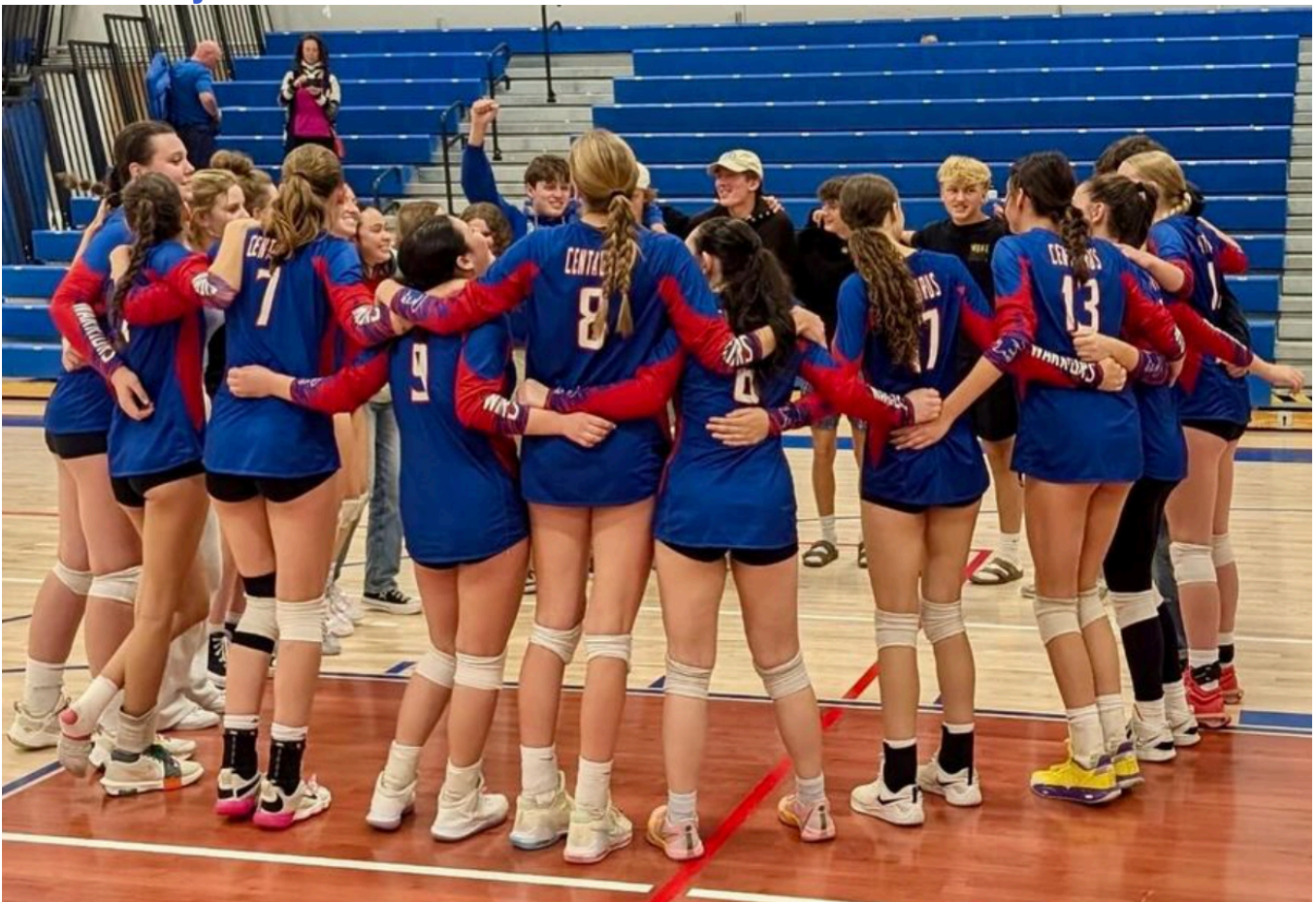
Girls volleyball got the 3-1 win over league opponent Holy Family!