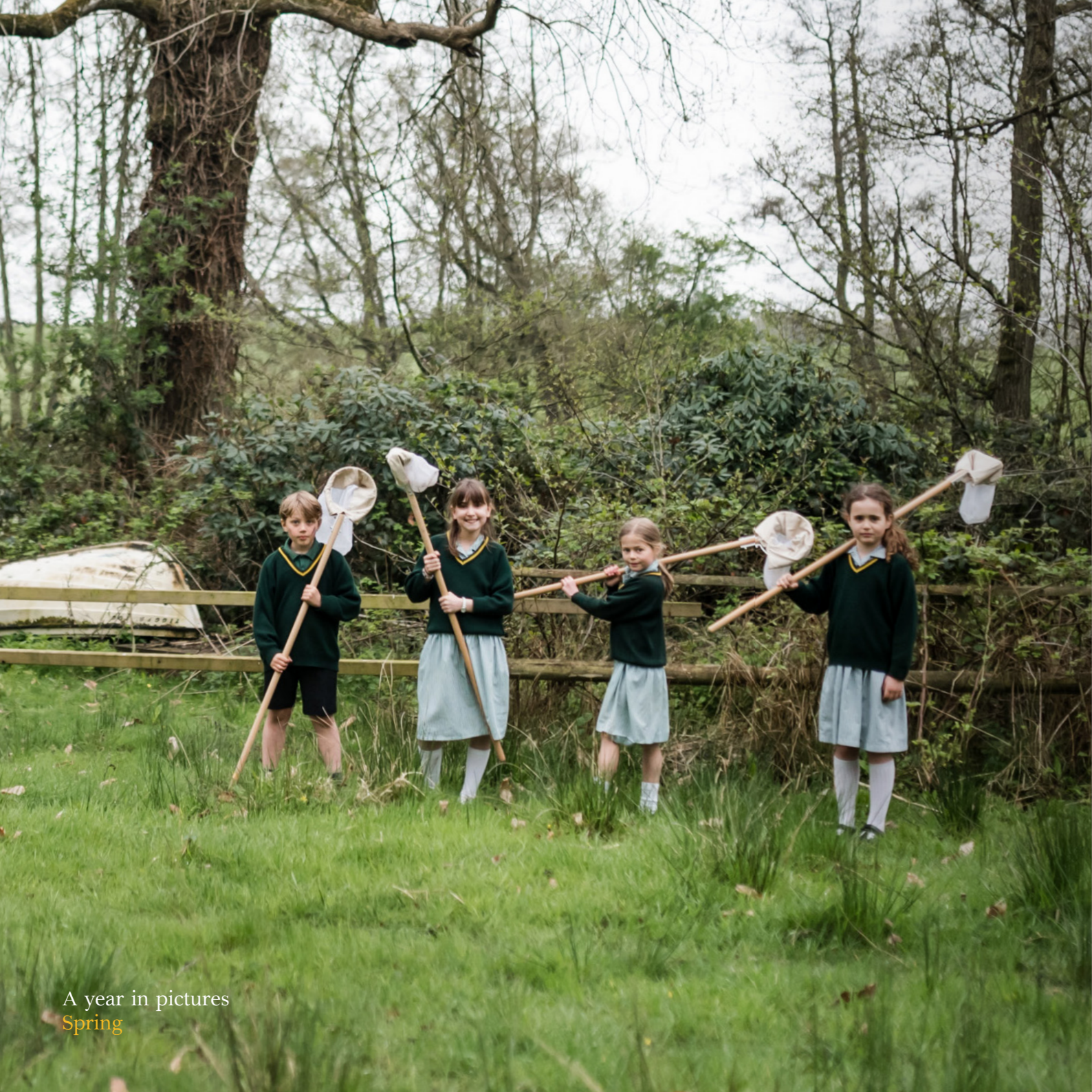
A year in pictures Spring