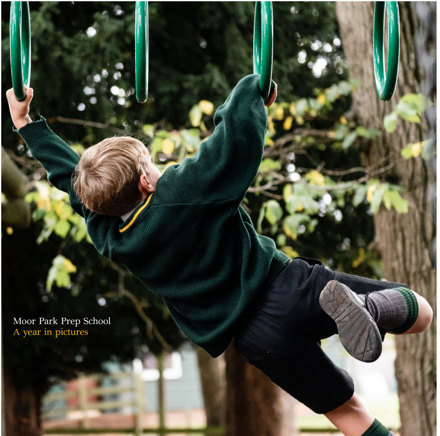
Moor Park Prep School A year in pictures