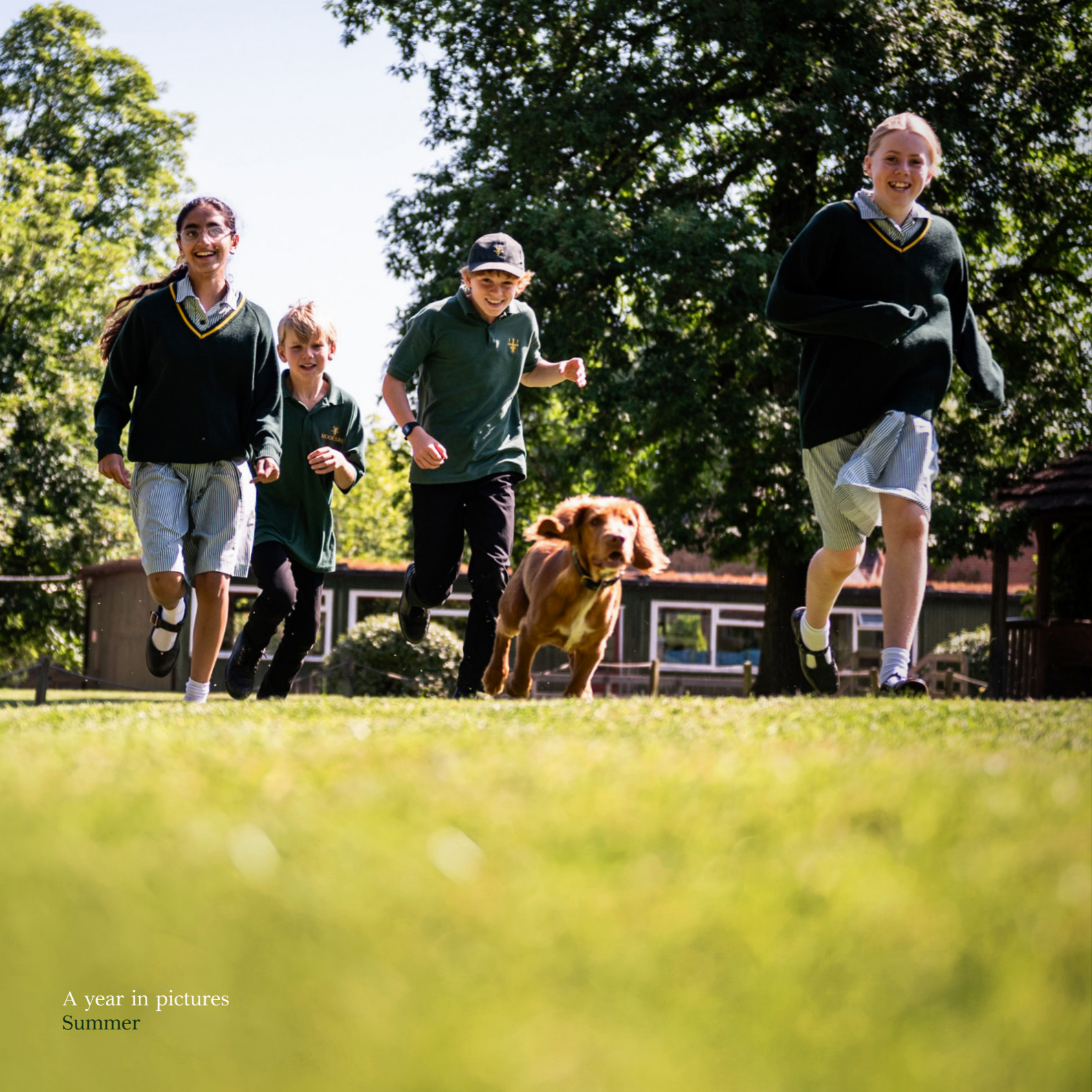
A year in pictures Summer