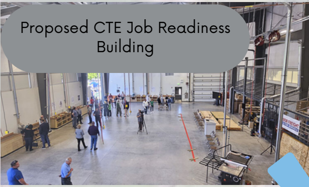
Proposed CTE Job Readiness Building