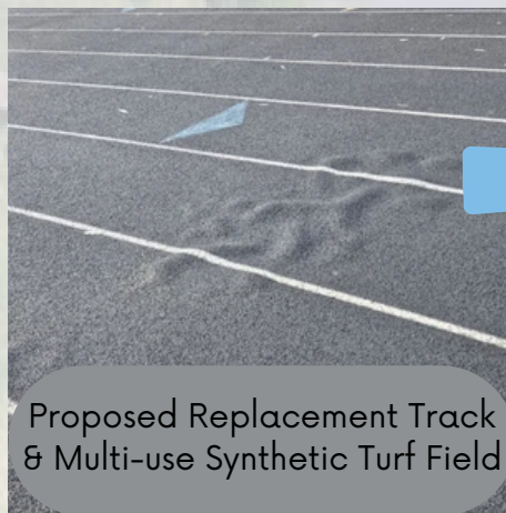
Proposed Replacement Track & Multi-use Synthetic Turf Field