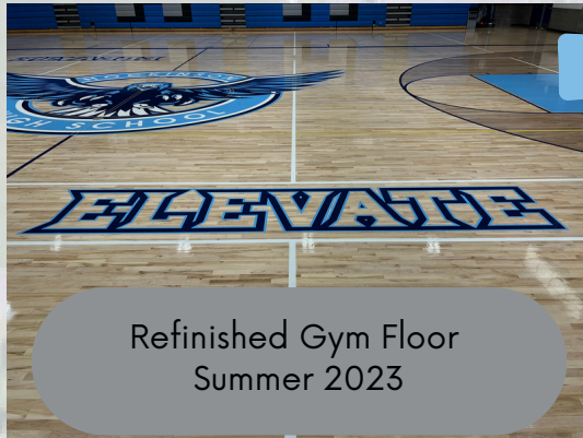
Refinished Gym Floor Summer 2023