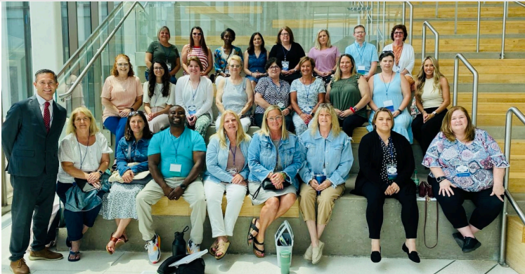
Over 75% of our NDS staff are certified level 1-4 by the School Nutrition Association.

School breakfasts and lunches are healthy meals that are required to meet the Dietary Guidelines for Americans in order to receive federal reimbursement. Farm-to-School foods are promoted and utilized in all Warren County schools. WCPS NDS follows strict federal nutrition standards, by offering meals to students that have a wide variety of fruits and vegetables, low-fat or fat-free milk, whole grain rich products, and lean protein. Staff, parents, and students are able to access the nutrition information about each daily meal via the MealViewer program. Each school's webpage has a link to the nutrition info or there is a MealViewer app that can be downloaded for easier access.