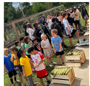
Students at Bristow Elementary learn about Fresh Corn.