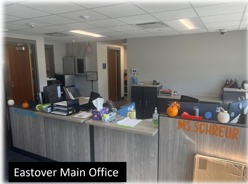
Eastover Main Office