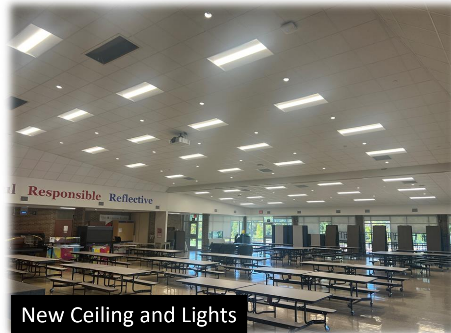
New Ceiling and Lights