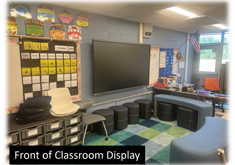
Front of Classroom Display