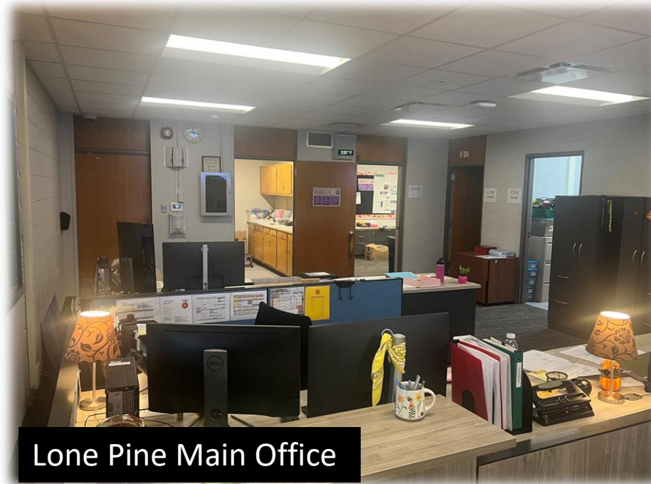
Lone Pine Main Office