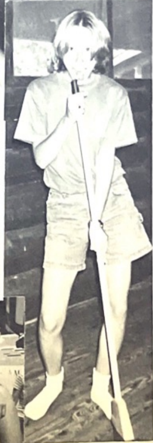
38th Annual Band Training Camp ----- Camp Ramblewood Darlington, MD August, 1998