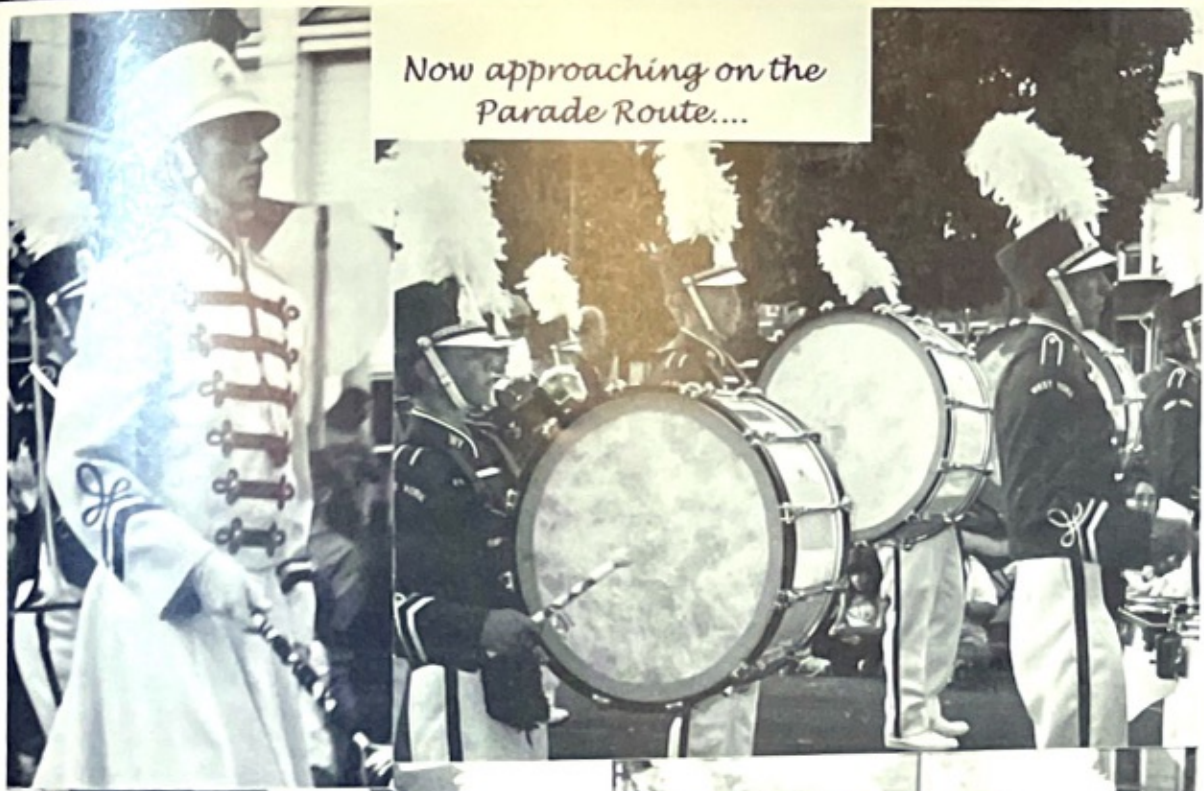
Now approaching on the Parade Route...