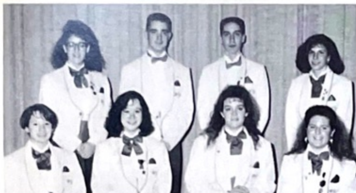
BAND EXECUTIVE COUNCIL 1991- 1992

Major projects developed by the council in the past include: the promotion of band jackets and shirts, the adoption of award pins, certificates and letters, and the planning of cultural exchange trips and certain phases of the band training camps.