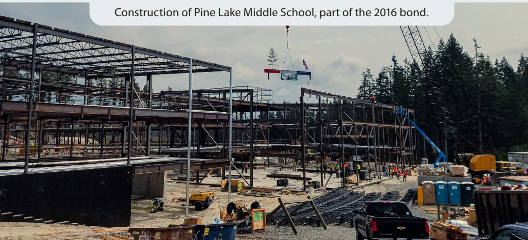
Construction of Pine Lake Middle School, part of the 2016 bond.

The state provides minimal funding for school construction and modernization, which is why school districts rely on local, voter-approved bond funding . Funding from the bond would be used to modernize buildings and infrastructure, giving every student in our district access to secure schools and innovative learning experiences that prepare them for their future. Bond funding would preserve our investment in facilities and ensure efficient and sustainable operations.