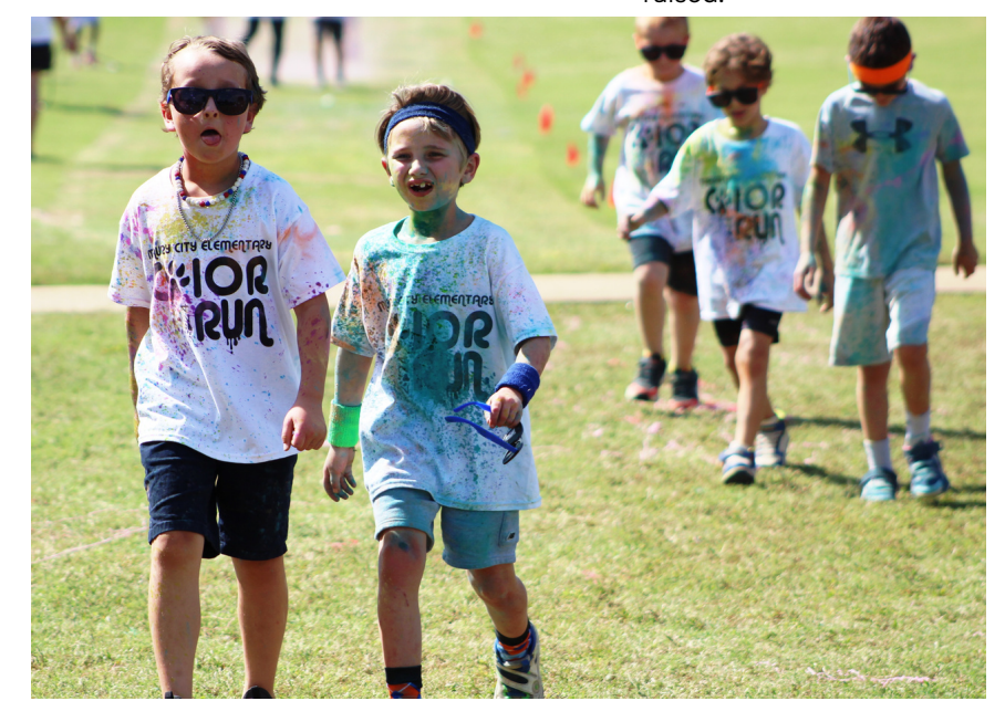
Above: Nobody minded getting messy -- especially these guys -- at the Maury City Elementary School Color Run Friday, which raised over $27,000 for the school.

The school awarded different prize levels for the amount of money each student raised.