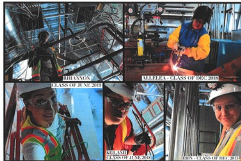
Pictured: TIP Graduates at work!

This program is funded in part by: SB1/California Workforce Development Board, United Way Bay Area, San Mateo County Measure K, the Deloitte Foundation, and PG&E