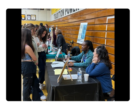
Kaiser School of Nursing