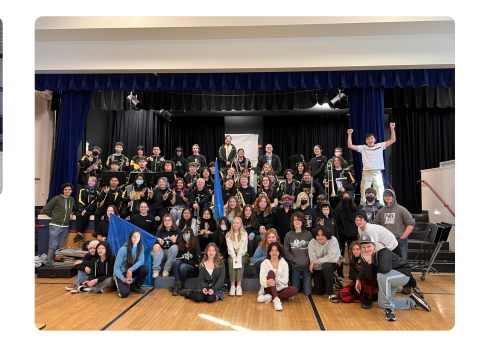
Ocean Shore School