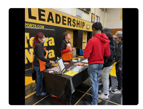
The Home Depot

Our Counseling Department organized our 8th Annual Career Fair on Wednesday, March 8th. This was a great opportunity for our students to engage with dozens of industry representatives. Through their conversations, they learned of amazing opportunities and the skills/classes needed to get to the next level whether that path is through a trade, the military or with a college degree. The industry representatives had nothing but positive things to say about our students who they described as intelligent, engaged, polite, thoughtful, and inquisitive.