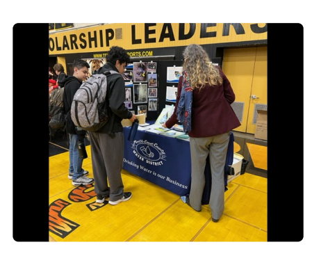
North Coast County Water District