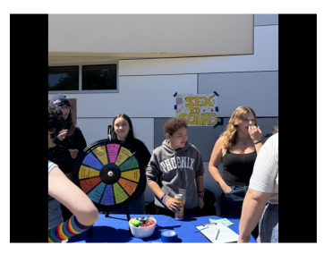
Sex Ed Squad