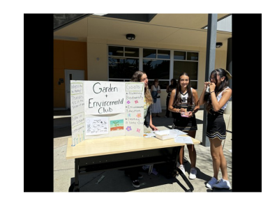
Garden & Environmental Club