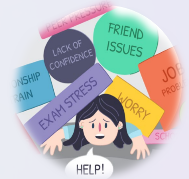
ASK FOR HELP