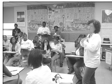
Student attendance is up this year due to parental support along with the board approved Attendance Policy.

For the 2005-2006 school year, students will need to have a course average of a "C" in addition to having two or fewer absences to opt out of a final exam. Also, new to the policy, a parent must sign a permission form in order for a student to opt out of a course exam.