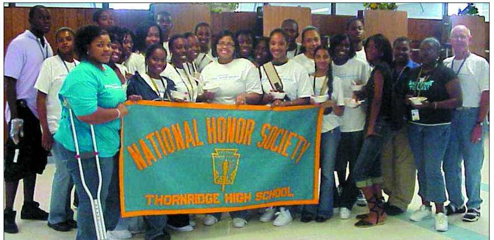
Congratulations to Thornridge's National Honor Society recipients

the school day where they will not be a distraction to the learning environment. Use of such devices is only permitted before or after school hours while outside of the building.