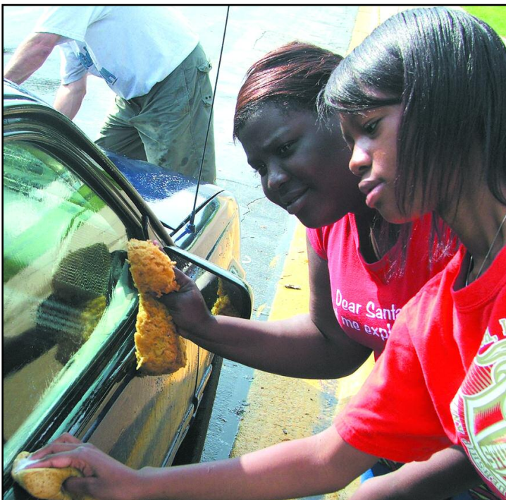
Thornridge High School held a free car wash and washed 104 cars in 5 hours!

It is our belief that by providing our students with a rigorous curriculum combined with exposure to taking weekly tests that they will meet or exceed state standards on the Prairie State Achievement Exam. Taking Thornridge from "Good To Great" is based upon turning this vision into a reality by utilizing best practices on a daily basis, communicating this vision to all stakeholders, being data driven, and rallying support from key individuals who want to make a difference in the lives of our children.