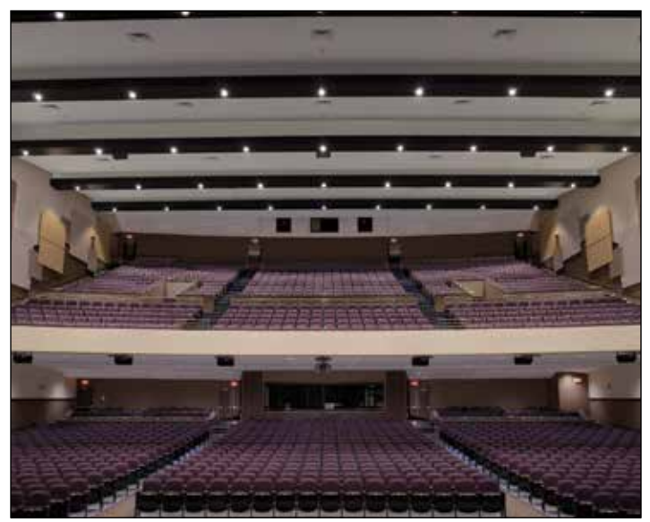
Thornton's Renovated Auditorium