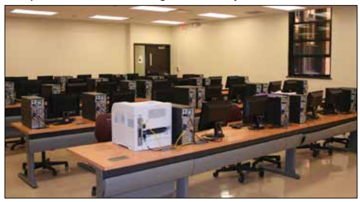
Renovated Computer Labs

The Board of Education is committed to providing a state of the art facility so our students are equipped to become competitive leaders in our global society.