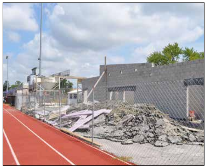
Under Construction Concession Stands