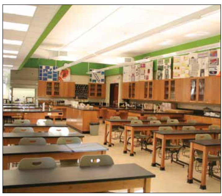
New Science Labs

We know that strong community support is critical to building and sustaining a world class school district. The Board of Education invites the community to experience the district first-hand by visiting our schools and monitoring the District 205 website - www.district205.net.