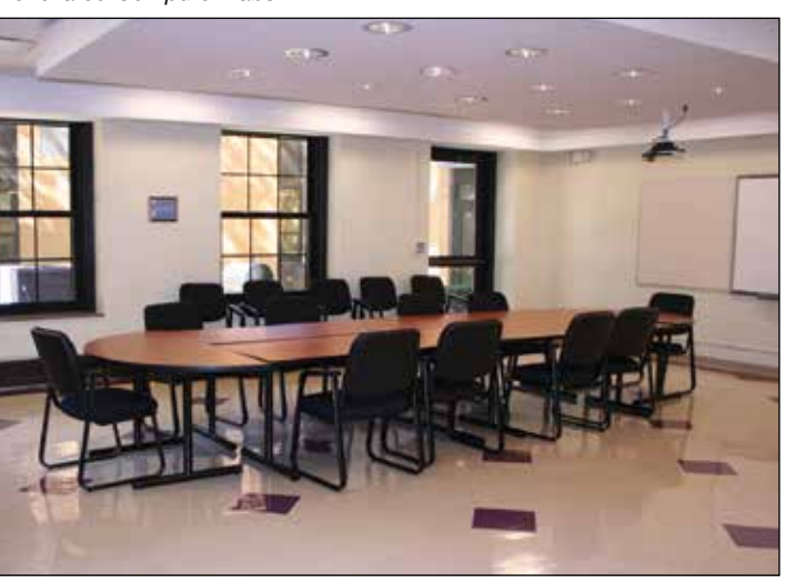
New Multi-Purpose Room