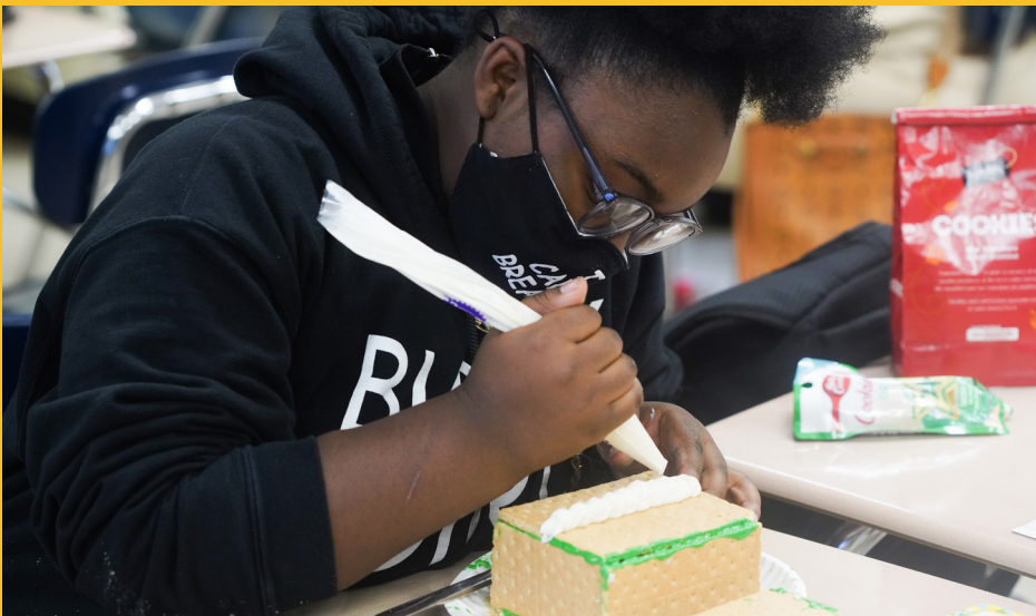
At Thornridge High School, students participated in FCCLA's holiday gingerbread decorating activities.