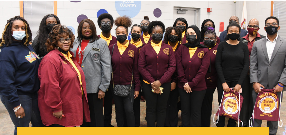
2021 COLLEGE AND CAREER PANEL

The Student Board of Education partnered with the Southland Juvenile Justice Council to host the Three E's of Success College and Career Panel on Saturday, December 4, 2021. Students could get their questions answered from panelists who are currently enrolled in college, in the workforce, attending trade school, or looking to pursue entrepreneurship. The event drew in 152 attendees, including both students and parents. In addition, eight colleges participated in the event, allowing students to speak with college representatives at the end of the panel.