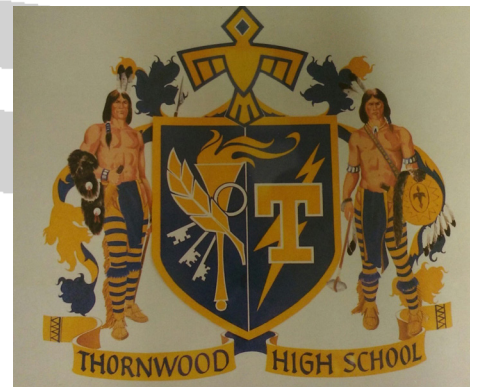
1981 Class Gift: Gifted by the Class of 1981, this original logo is still at the entrance of Thornwood's cafeteria