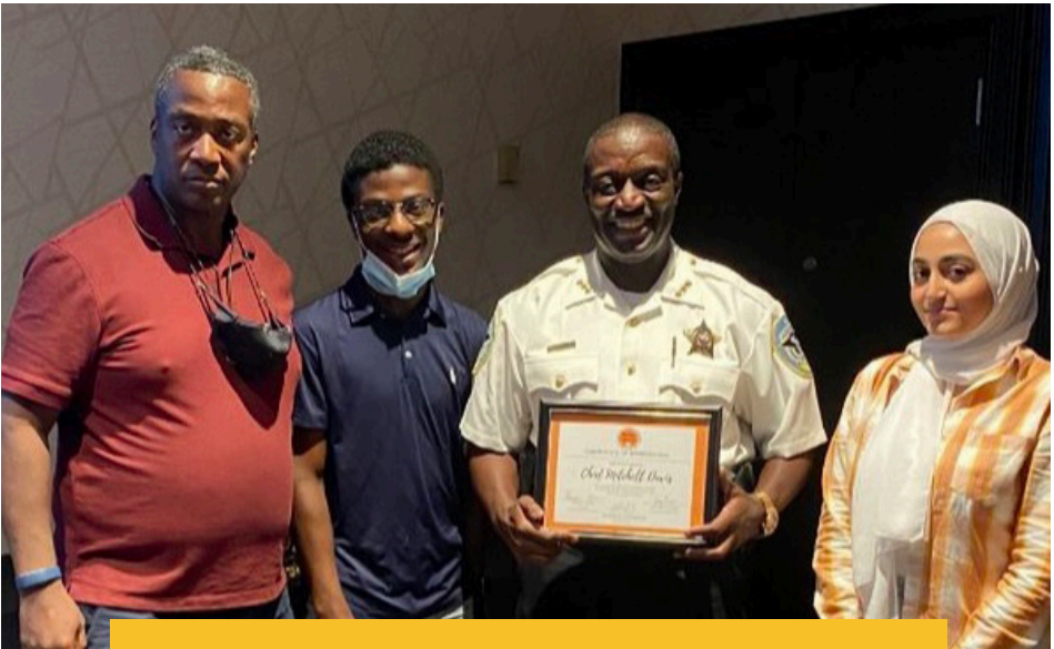
LEADERSHIP RETREAT FOR SBOE