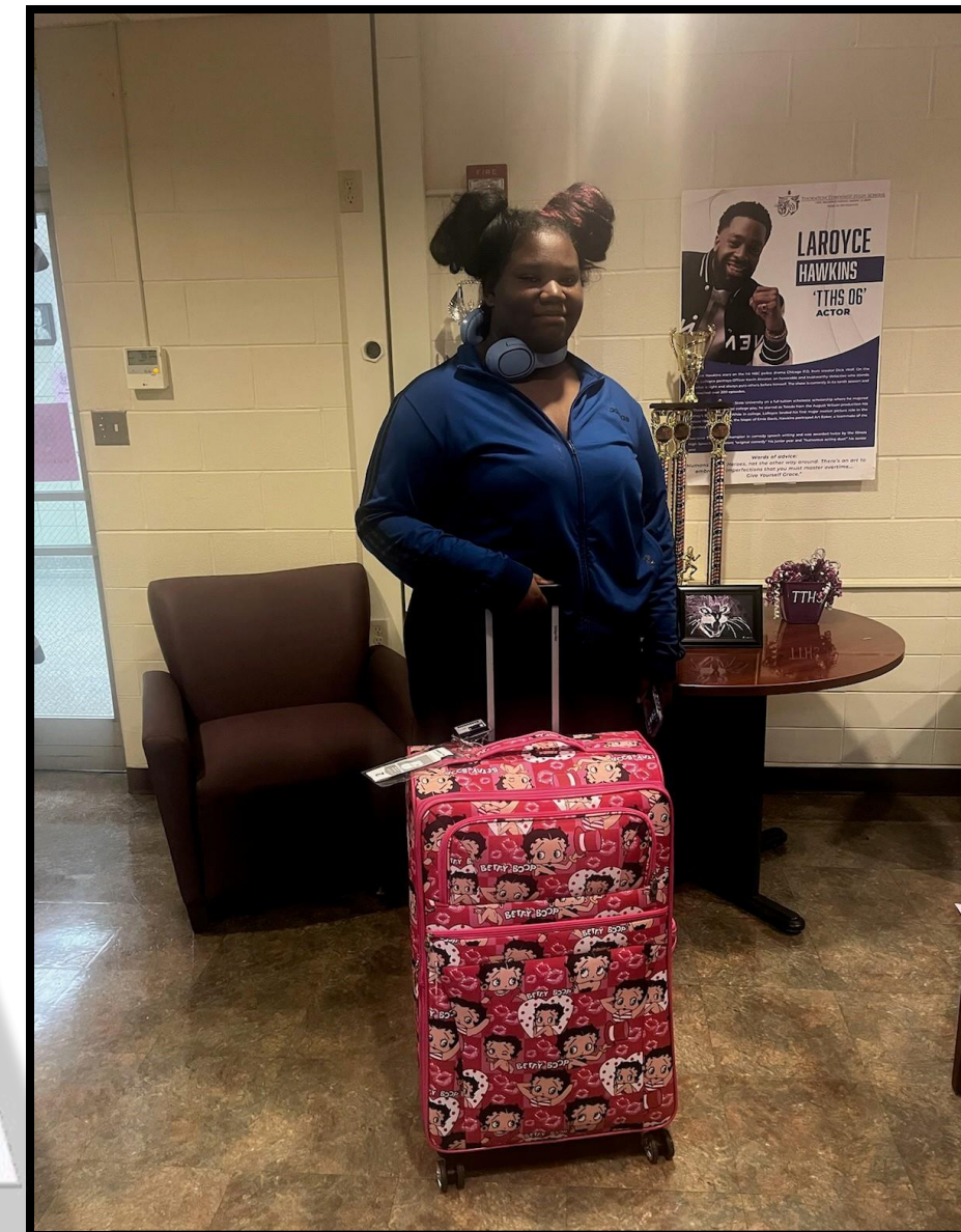
Anything But a Backpack Day