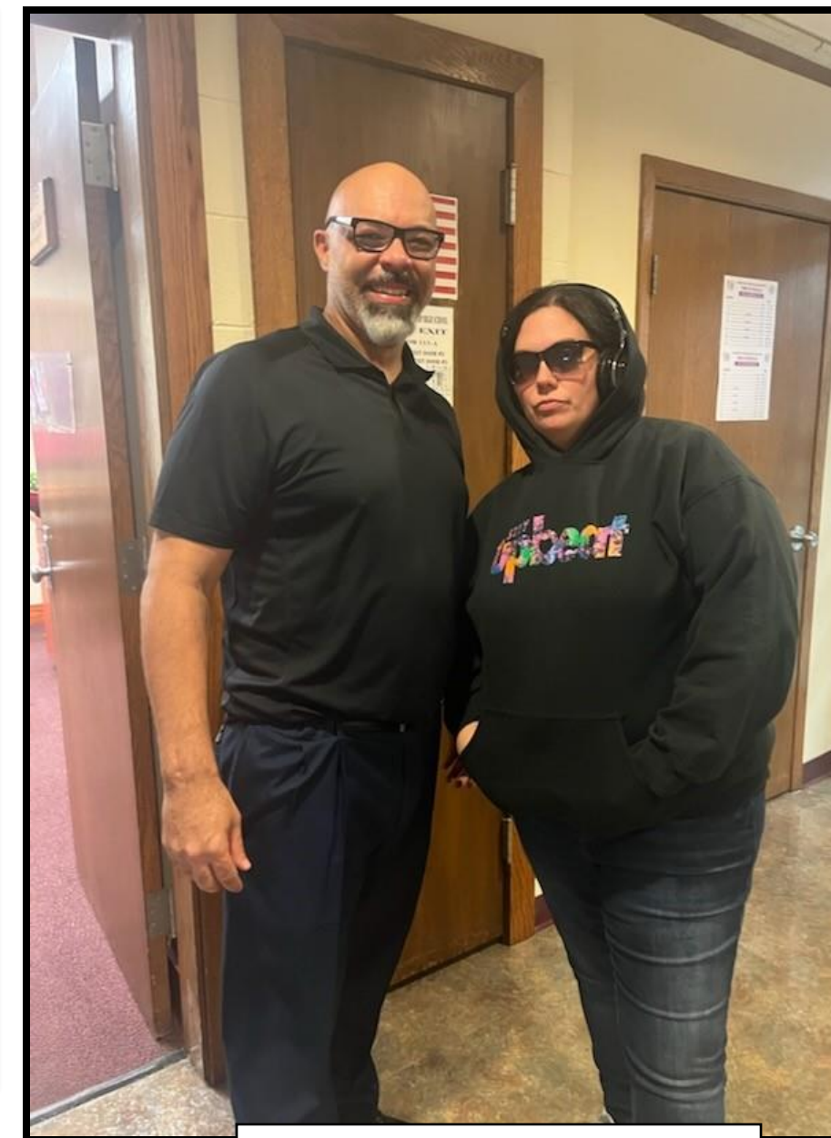
Teachers dress like students