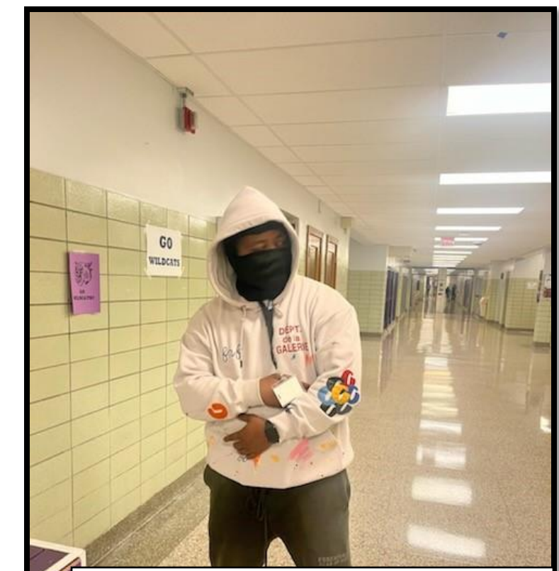
Teachers dress like students