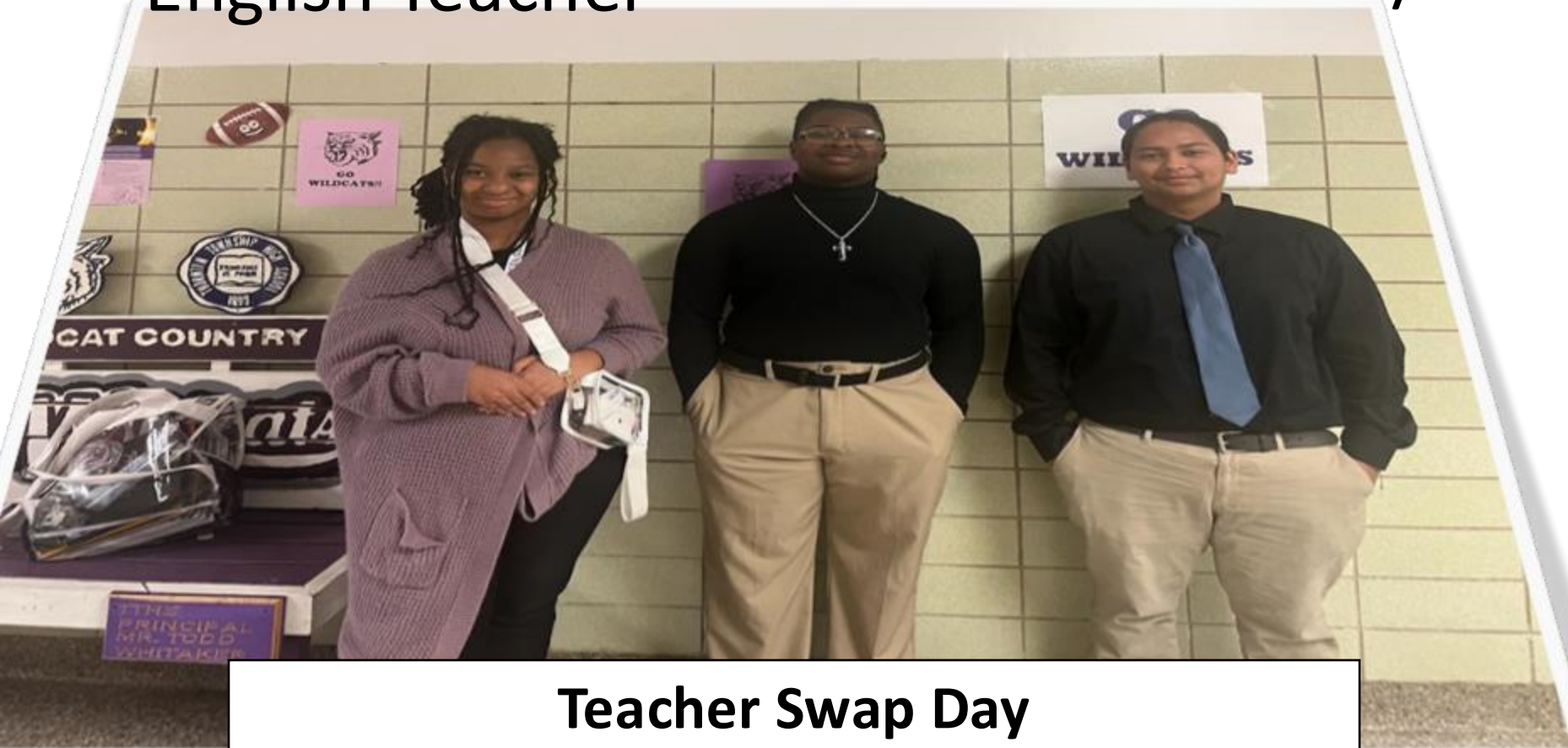
Teacher Swap Day