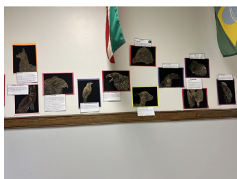
Student Art Work