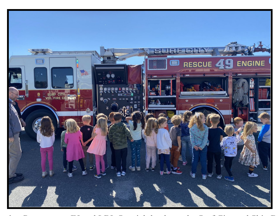
Fire Prevention Programs at EJ and LBI. Special thanks to the Surf City and Ship Bottom Fire Departments for putting on a great presentation!

In ELA we will be studying the fantasy genre and working on sentences that describe by creating descriptive spooky sentences for Halloween. In Spelling, we are currently working on final blends using the Orton Gillingham method of practice. In Social Studies second grade is continuing to learn about our nation's government specifically the three branches of government and the importance of being a good citizen. Finally, in Science, the second grade is continuing their work on Unit 1 Properties of Matter. Students have been observing various objects and identifying objects by their properties.