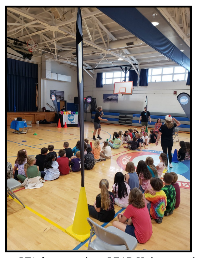
Special thanks to our PTA for sponsoring a LEAD U character education assembly and workshops for LBI Grade School students!