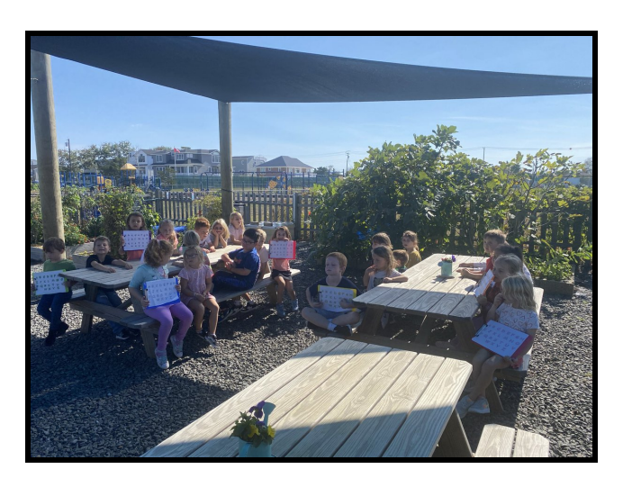
Kindergarten Crew working cooperatively to search for uppercase and lowercase letters in the garden and having a blast!

In writing we just finished up a 3 week illustration unit that culminated in the children's first story!