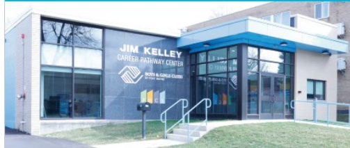
The Jim Kelley Career Pathway Center operates through a collaborative effort between Fort Wayne Community Schools and the Boys & Girls Club of Fort Wayne.

Students EXPERIENCE a glimpse of the skills needed to be successful in the fields of information technology, advanced manufacturing, health sciences, automotive and construction trades.