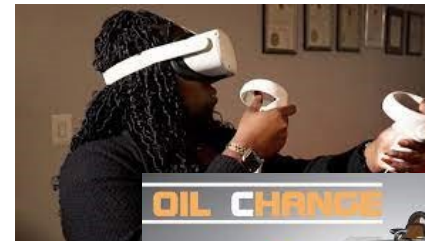
VR Auto Engine Oil Change