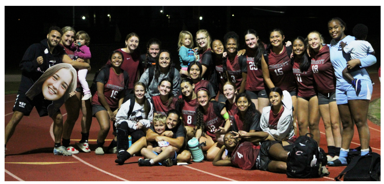
Above: A final team shot, with some Branson kids thrown in for good measure. Crockett is now 10-3-1 for the season.