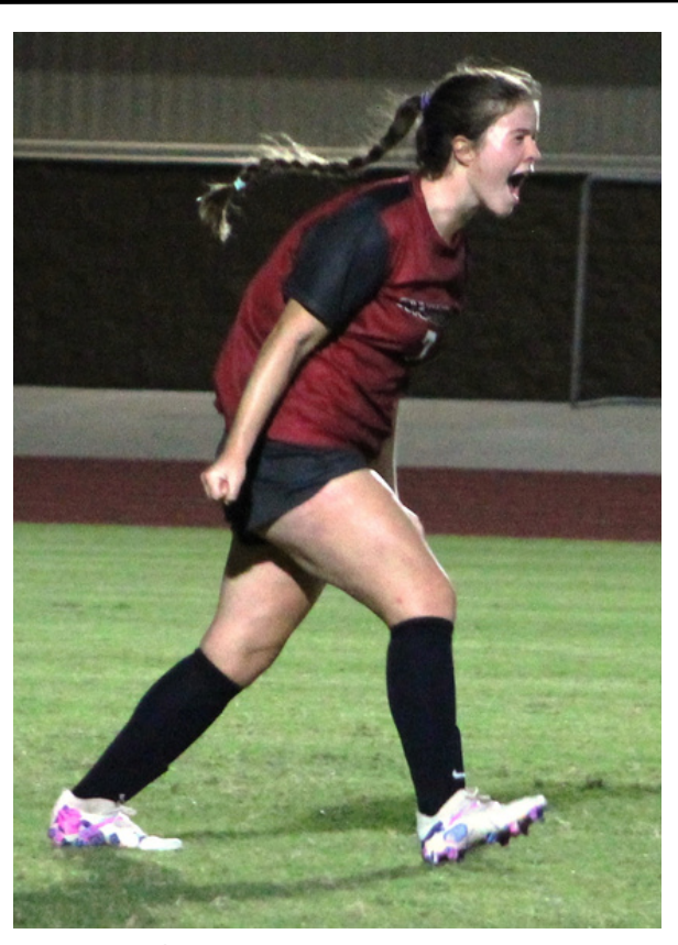
Above:... before spinning around and emitting a primal scream of accomplishment after putting Crockett within reach of a Regional Tournament berth next week...