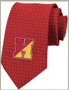
Red with white polka dots with H: $20

Haverford Dresses for Success: We Mean Business!