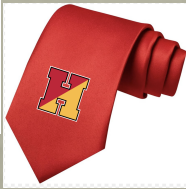
Solid red with H: $18