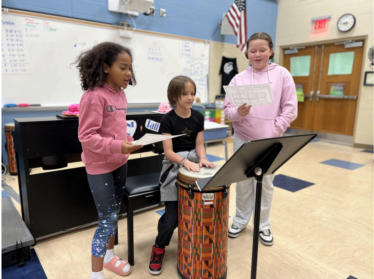
5th grade choir students break from rehearsing to compose and perform their own Halloween rhythms.