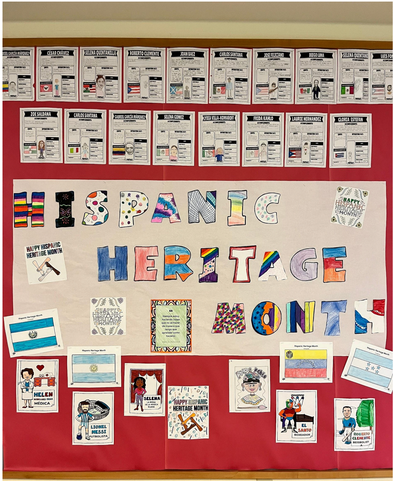
Awesome display on the 2nd Floor of student work in recognition of Hispanic Heritage Month.