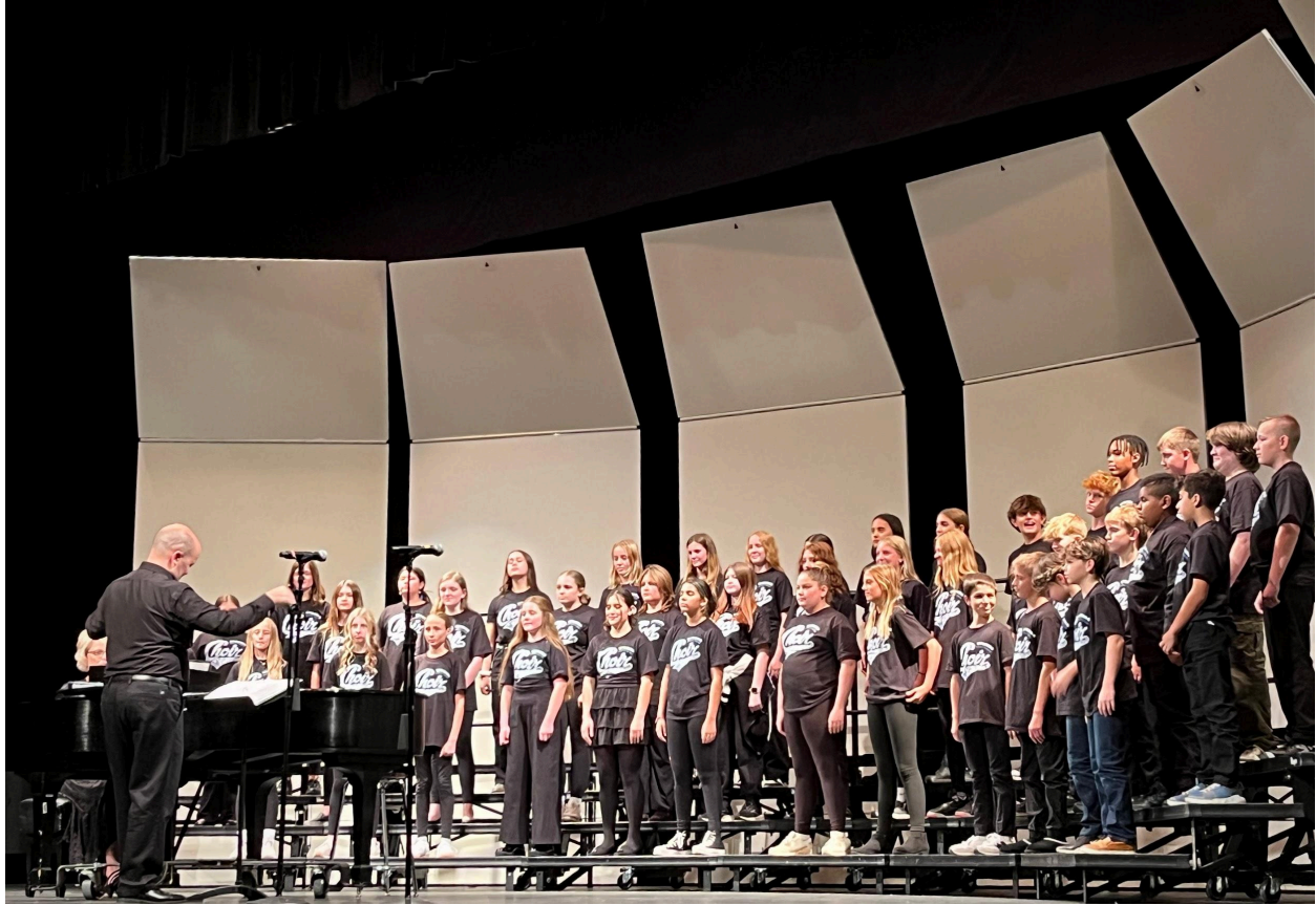
Choir Students did a great job at their concert Tuesday evening!