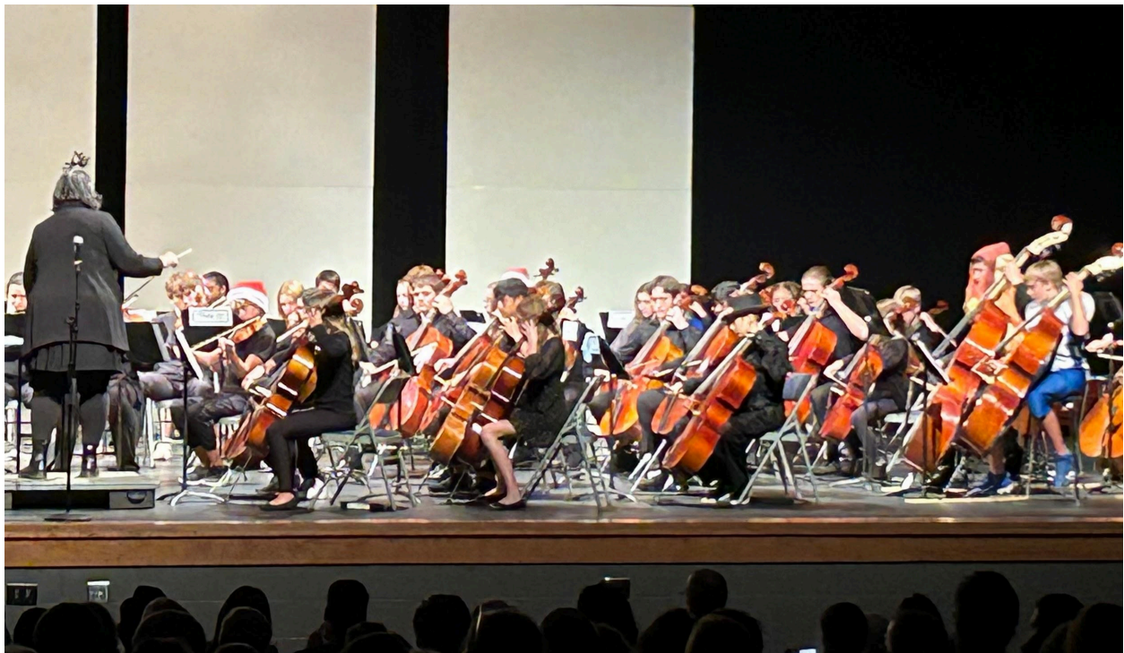
Strings students performed wonderfully on Wednesday night.