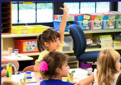
Next fall, Waverly students may receive world language instruction as part of a newly-implemented Foreign Language in Elementary School (FLES) program.

The proposal calls for a gradual three-year rollout of the FLES program, beginning with the curriculum being introduced to K-1 students next fall, students in grades 2-3 in the fall of 2024, and those in grades 4-5 in 2025.