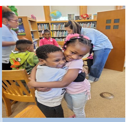
House Meeting Day