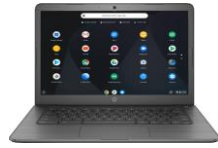
Know Your Chromebook