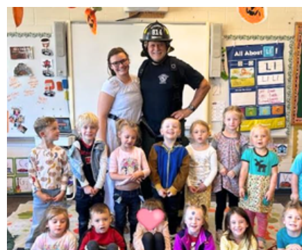
4 Year Old Kindergarten

On Wednesday, October 16th, Fox Prairie students will explore the Overture Center on a field trip. Their annual WFK Trunk or Treat will be held on Friday, October 18th, from 5:15-6:30 pm. Finally, Parent-Teacher Conferences and Book Fair on October 23rd and 24th.