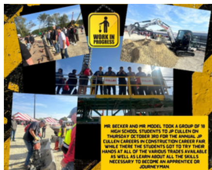
Stoughton High School

SHS recently celebrated Custodial Day to honor their hardworking staff. This month, their character theme is "Upstander," focusing on students who take a stand against injustice. The school will be recognizing these exceptional students. In addition, they're conducting safety drills throughout the month to promote safety awareness.