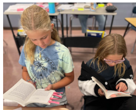
Fox Prairie Elementary

Sandhill completed its fall safety drill and picture retakes. 3rd grade staff and students are busy planning a Veterans Day celebration for November. Students have been busy with lots of field trips, including 5th grade's recent trip to the Hoard Museum and Aztalan State Park!