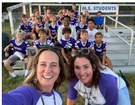
River Bluff Middle School

Kegonsa students are expanding their knowledge through hands-on experiences. They've explored survival skills, environmental conservation, and agriculture through field trips. In October, they'll continue learning about science, farming, and space at various locations.