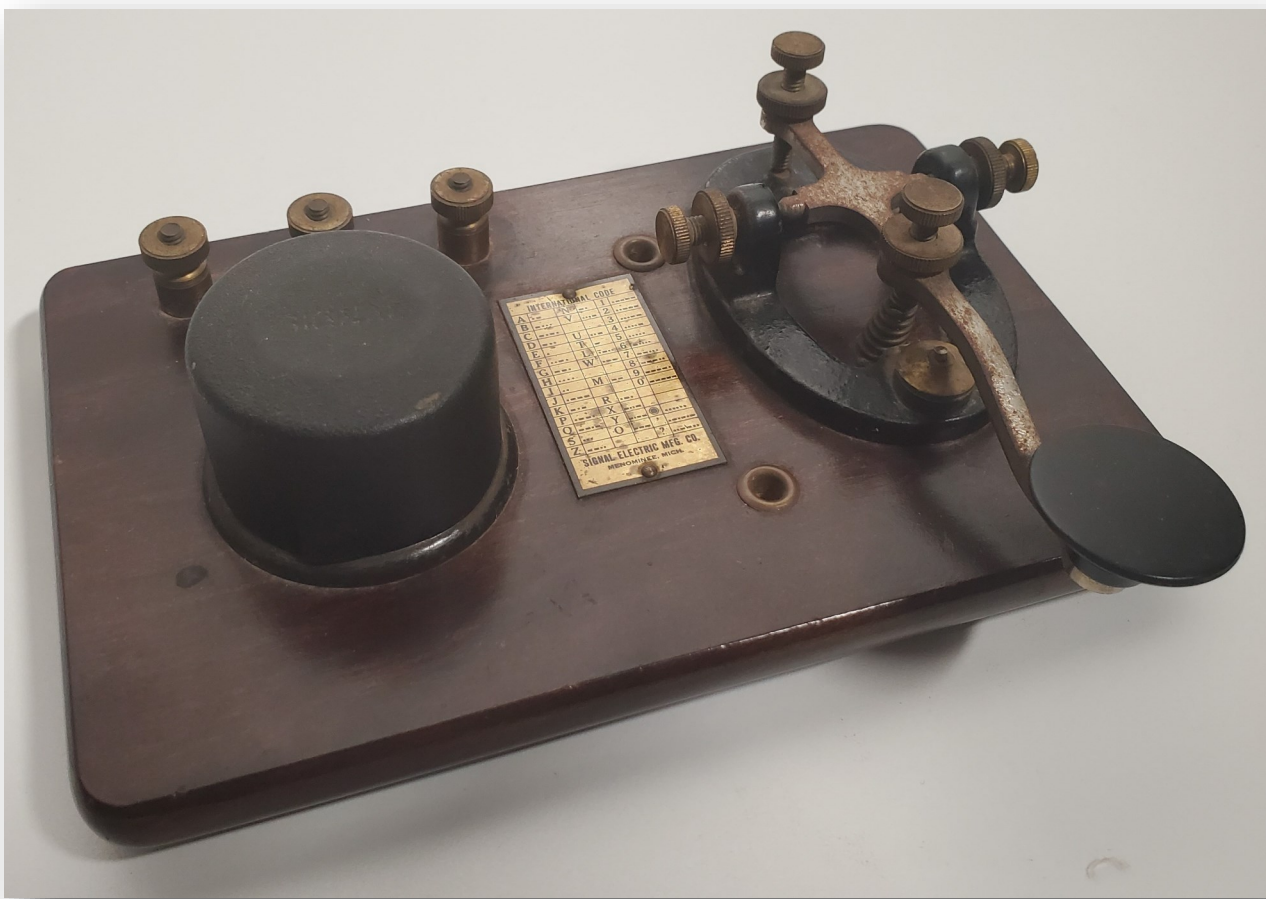
Signal Electric Manufacturing Company Ltd. Wireless Practice Set R-68, c. 1940 Fulton County Schools Teaching Museum, Technology collection

Sometimes an invention comes along that changes the world forever. It combines scientific discovery with ingenuity to impact humankind in ways that are unexpected and everlasting. So it is with the introduction of the electric telegraph in the middle of the 19th Century.