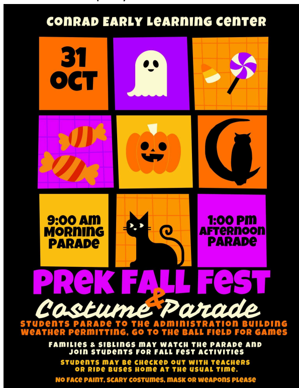
Fall Fest & Costume Parade