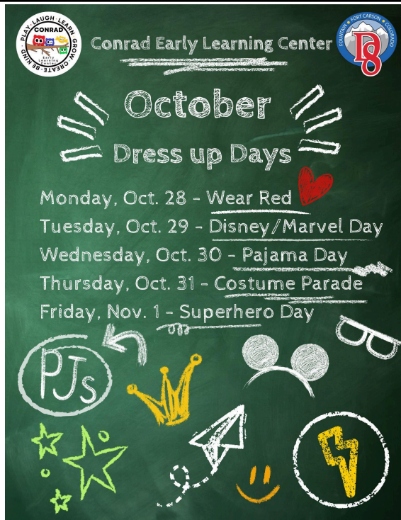
October dress up days