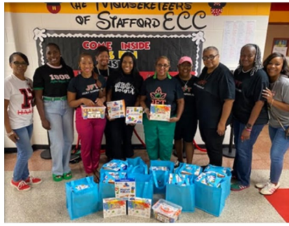
The JFT ladies of Alpha Kappa Alpha Sorority donated STEM kits to every Kinder classroom.