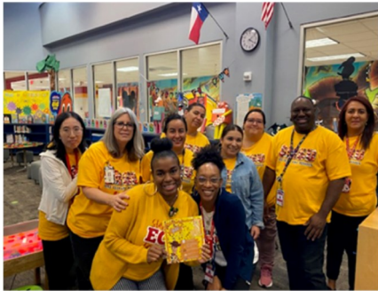
Teachers completed a True Colors personality quiz to identify their personality trait by color.