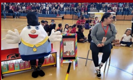
Kinder culminated their Nursery Rhyme unit with a Nursery Rhyme Olympic day where Humpty Dumpty made an appearance and students had to put him back together again.