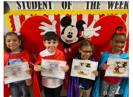
Spartan Champions are highlighted weekly for academic and behavioral performance.