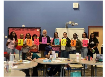
Leadership utilized "Choosing to Lead w/Care" TedTalk to help teachers reconnect to their WHY.