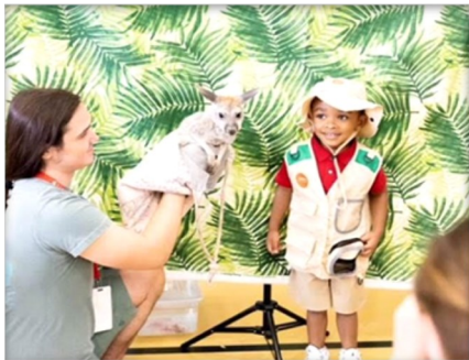
Learning was brought to life as students engaged with animals from Barn Hill Preserve.