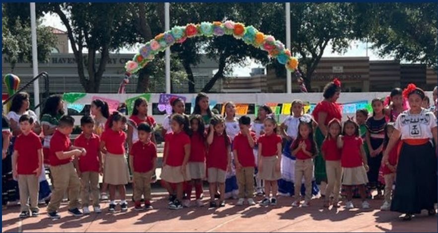
SECC student choir at district’s community Hispanic Heritage celebration.