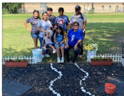
SECC partnered with CityRise Church to clean and restructure its Reading Garden after Beryl.