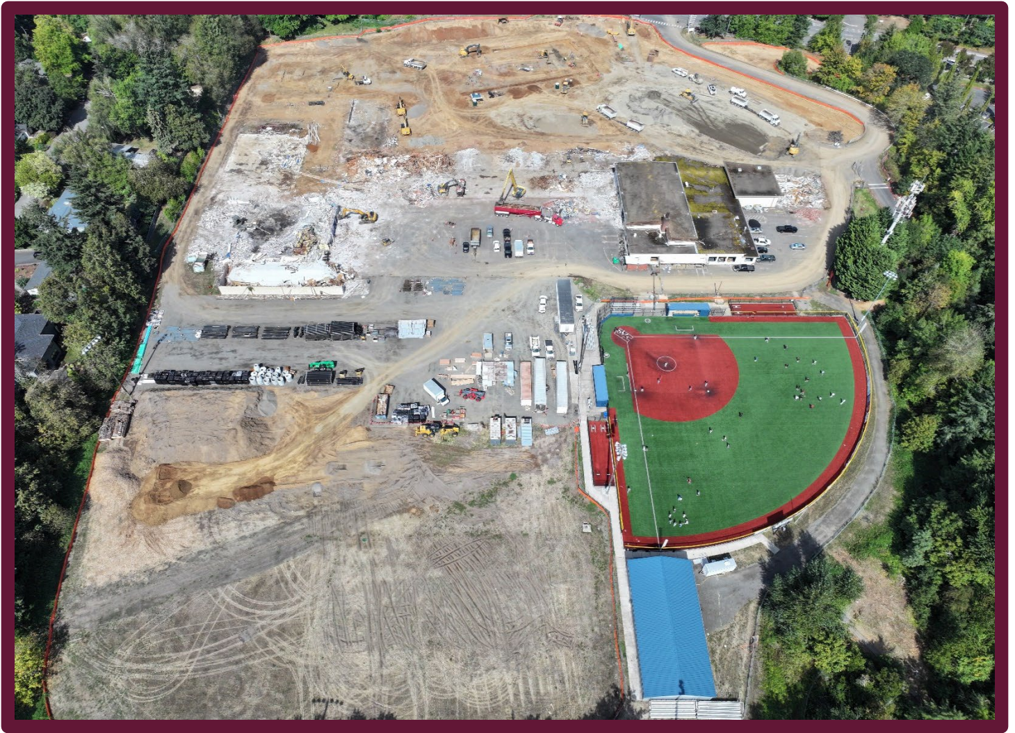
LOMS Construction Site