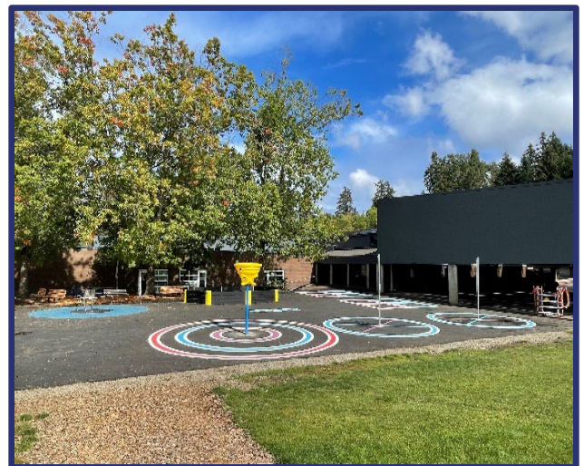
Westridge Playground Upgrades