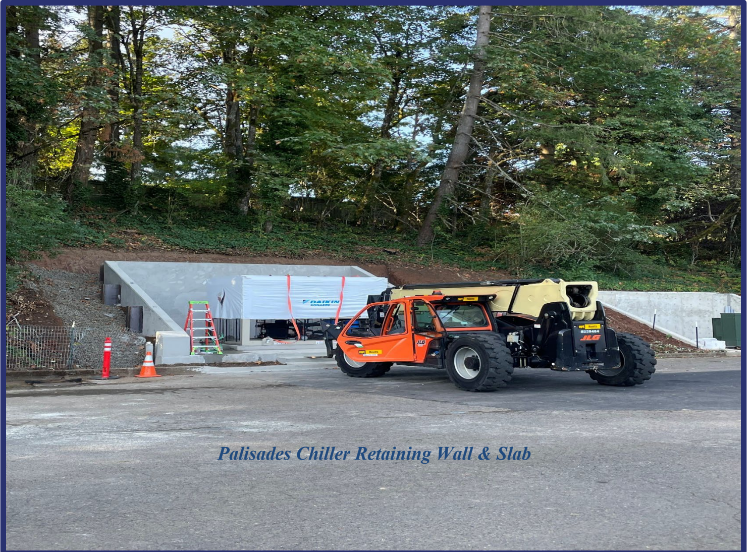
Palisades Chiller Retaining Wall & Slab

Palisades Elementary Renovations Playground & Garden Upgrades Elementary Schools HVAC Retrofit