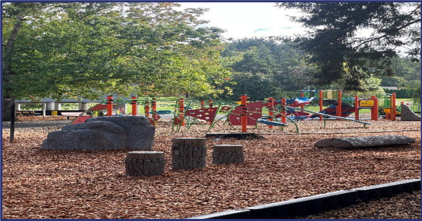
Westridge Playground Upgrade