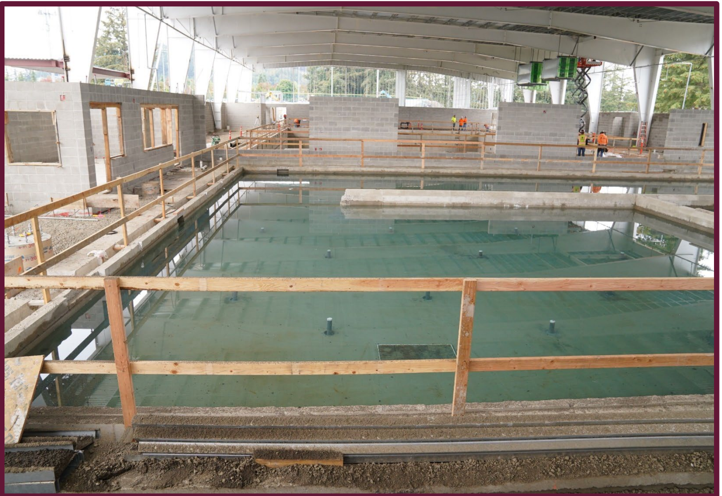
Leak Testing the Pools