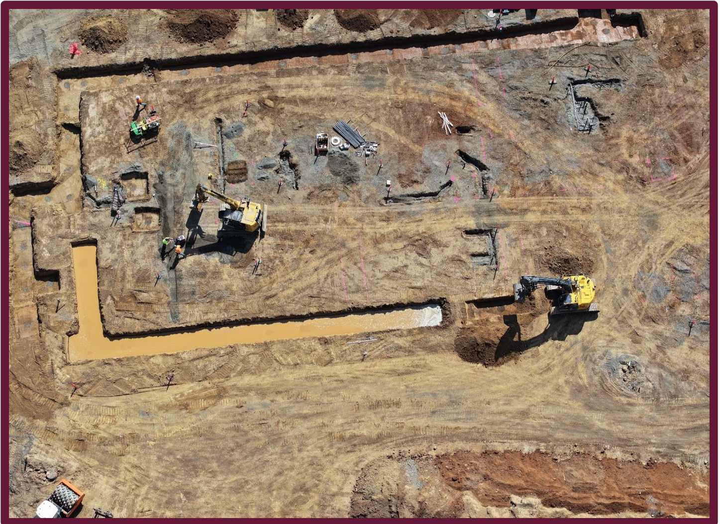
LOMS Concrete Footing Earthwork