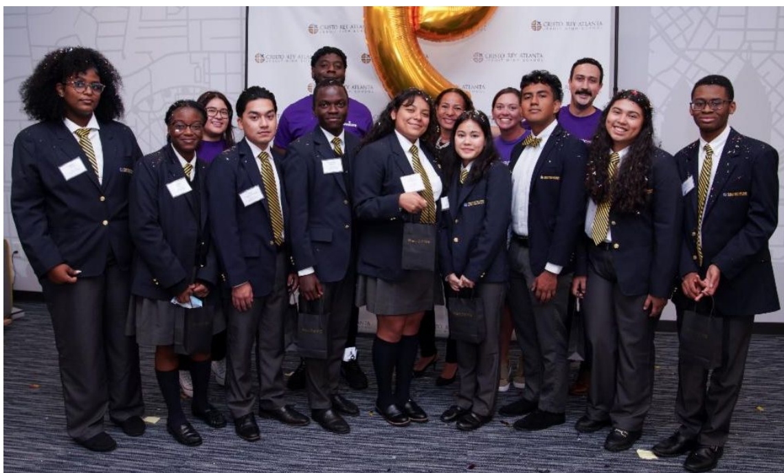
The 2023-2024 Accenture CWS team at Draft Day

Accenture employs nine students in the CWS program this year. Students work alongside colleagues to drive productivity, and the company recognizes the potential impact of the program on its future workforce.