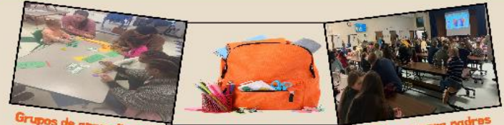
Grupos de aprendizaje