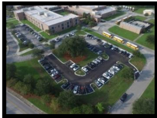
Academic Magnet HS Parking