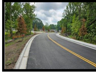
Pepperhill ES Car Loop