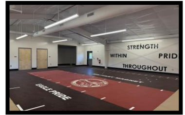
Military Magnet Athletic Facility