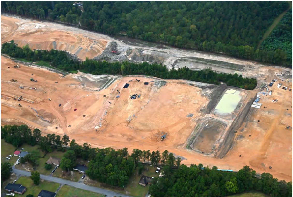
9/24/24 View of Practice Fields