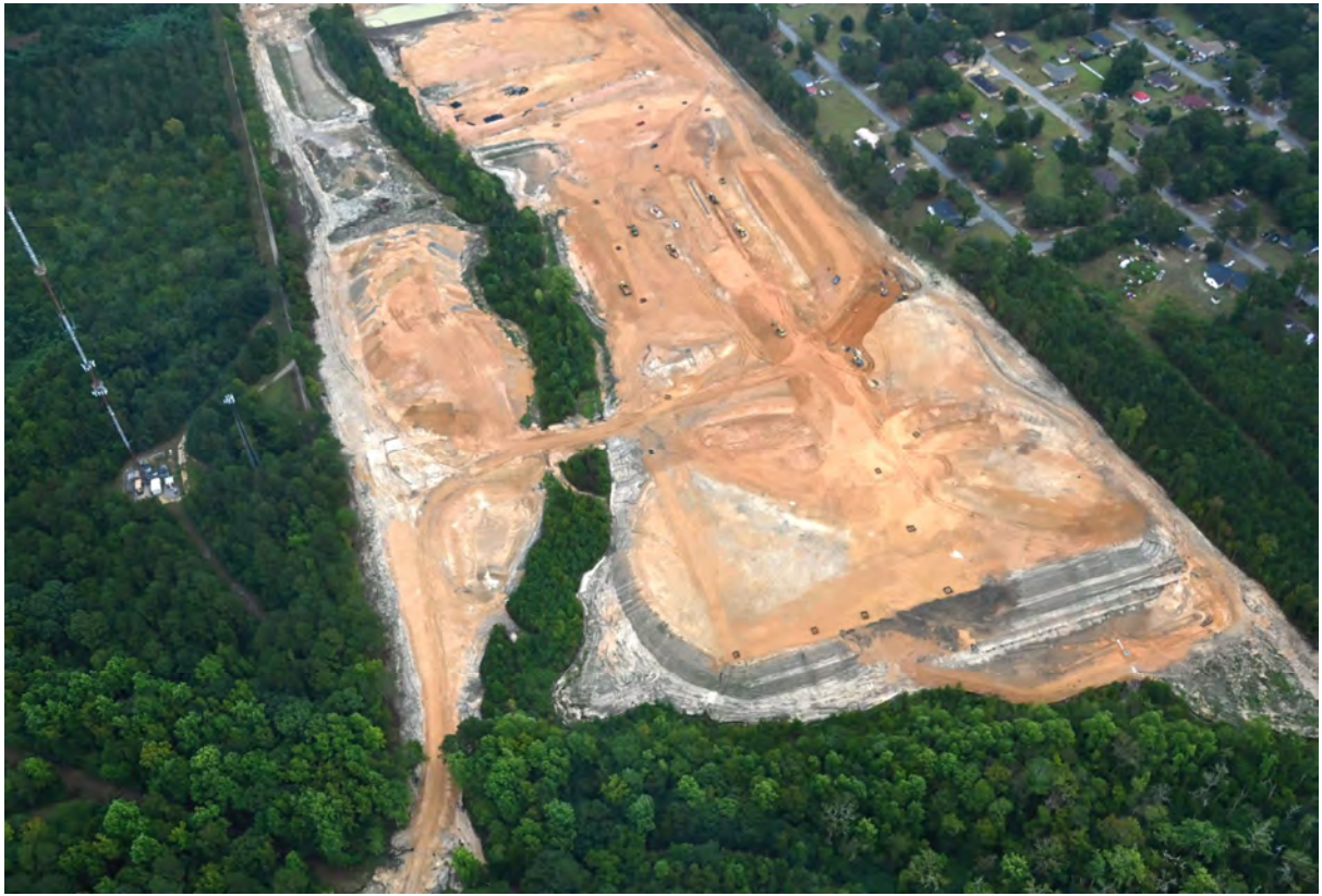
9/24/24 View of Baseball / Softball Fields