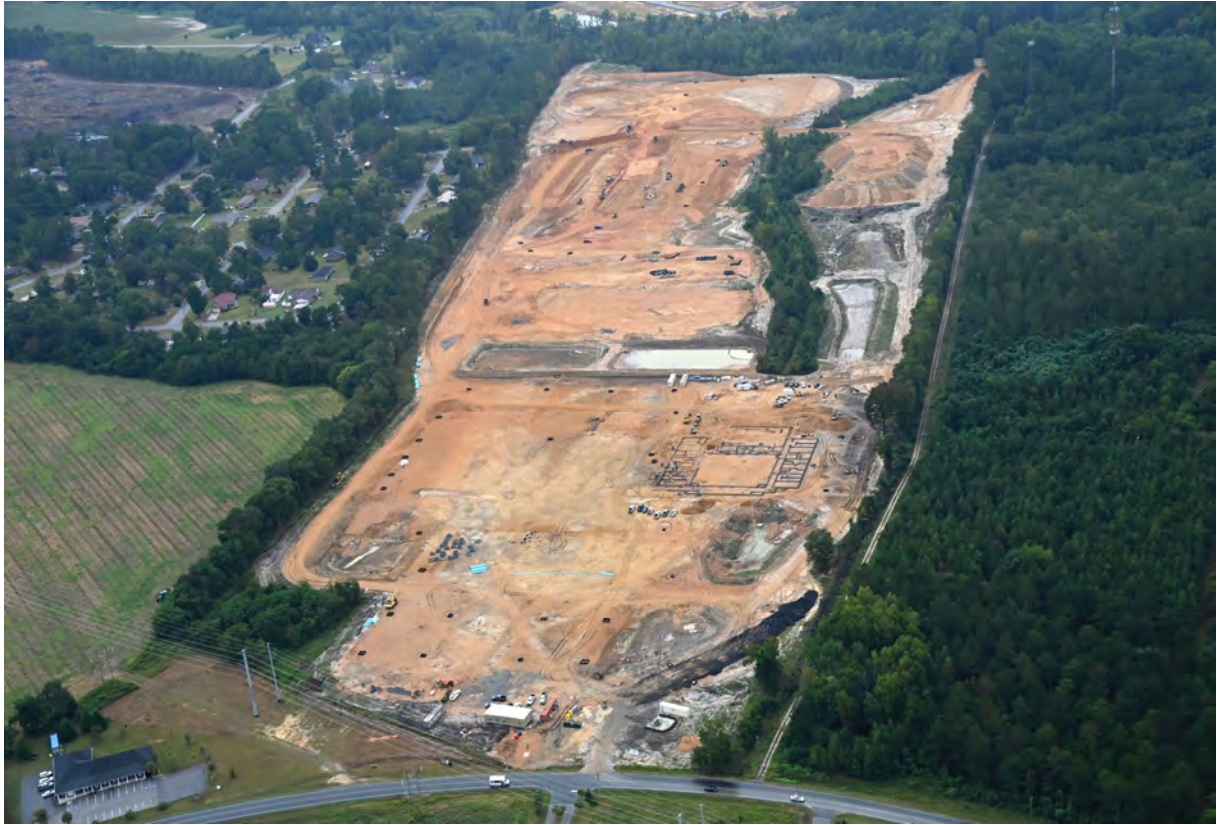
9/24/24 View from Cook Road