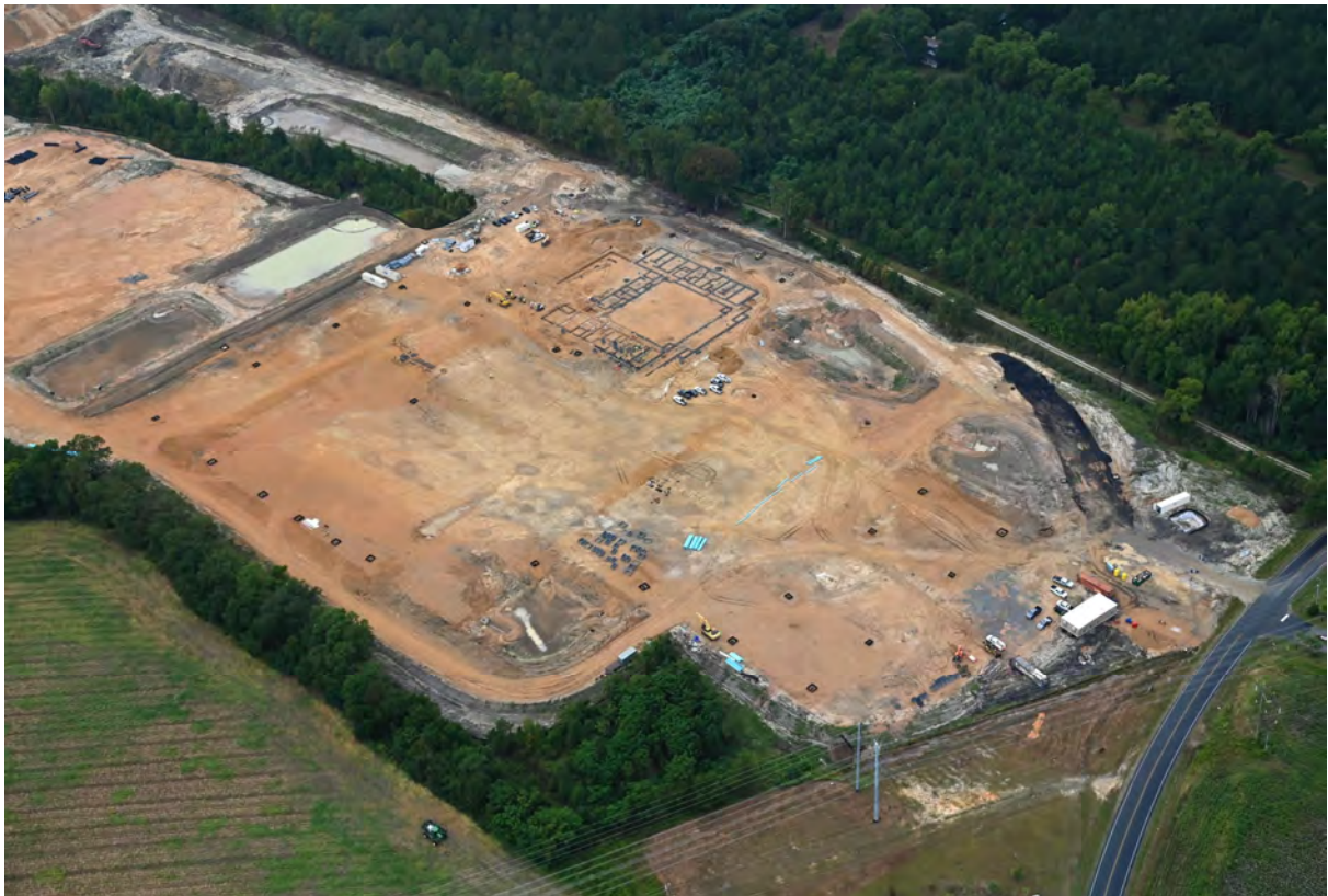
9/24/24 View of Main Building