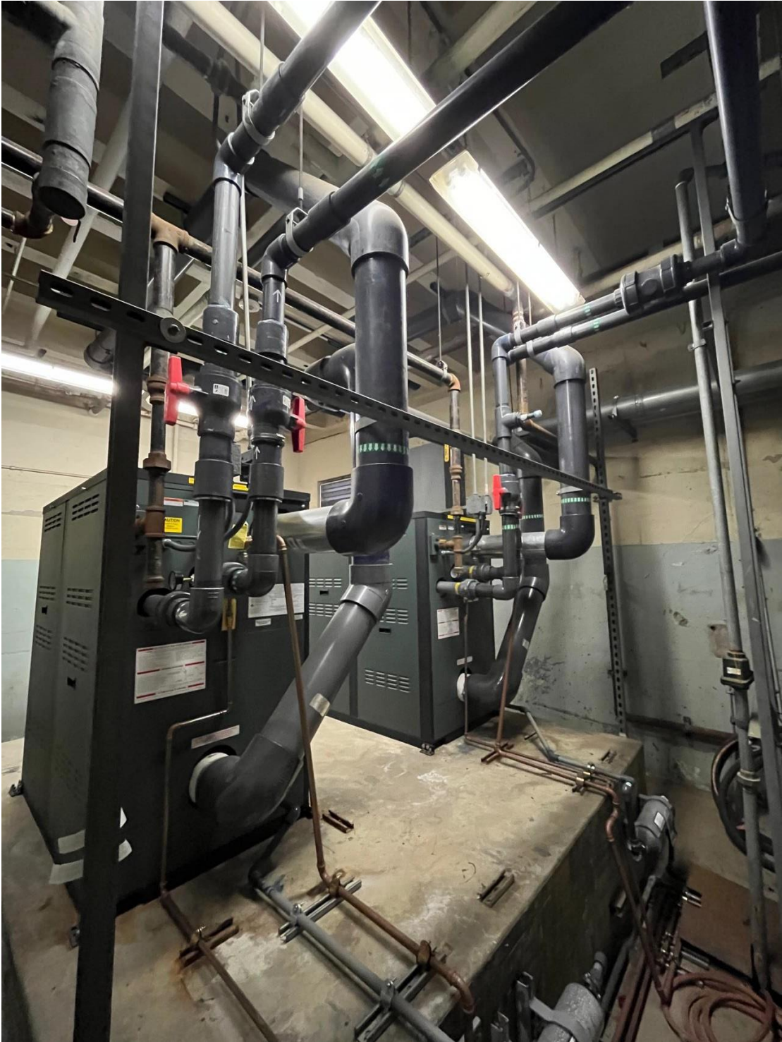
A new pool heating system was installed at Ventura High School.