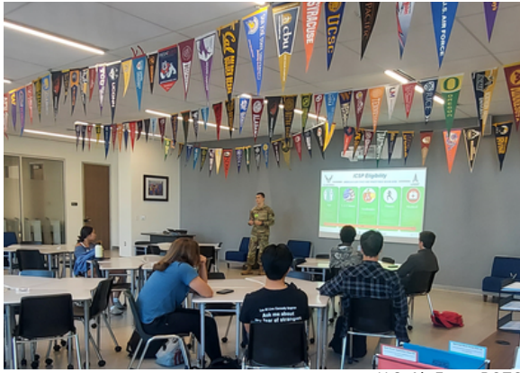
U.S. Air Force ROTC