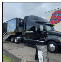
Army STEM Mobile Experience