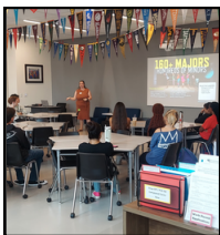
University of San Diego

We also had a great experience in the ARMY STEM Mobile Experience. Students had the opportunity to engage with their inter-active Robotics and Computer Science programs.