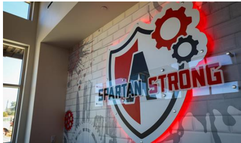
Arcade Middle School