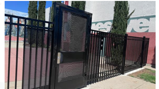
Mesa Verde HS