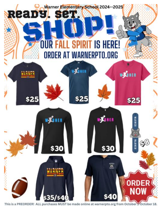
We will NOT have any styles in backstock.

Our fall spirit wear is now LIVE! These styles will only be available for PREORDER at <u>warnerpto.org/shop</u> from October 1st-October 18th. We will NOT have any of these styles in our inventory, so if you want them you MUST order them on our website! If you have any questions please email <u>majorfundraising@warnerpto.org</u>.