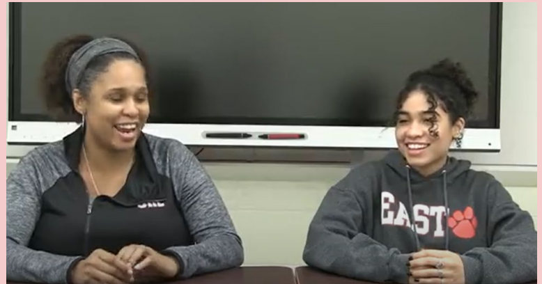
Cherry Hill High School East