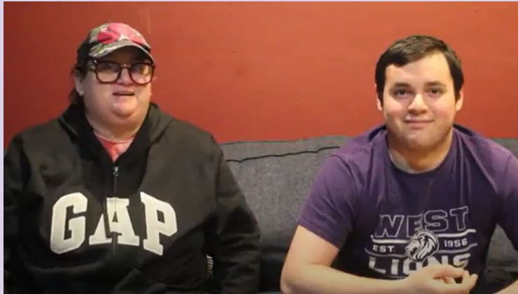
Cherry Hill High School West