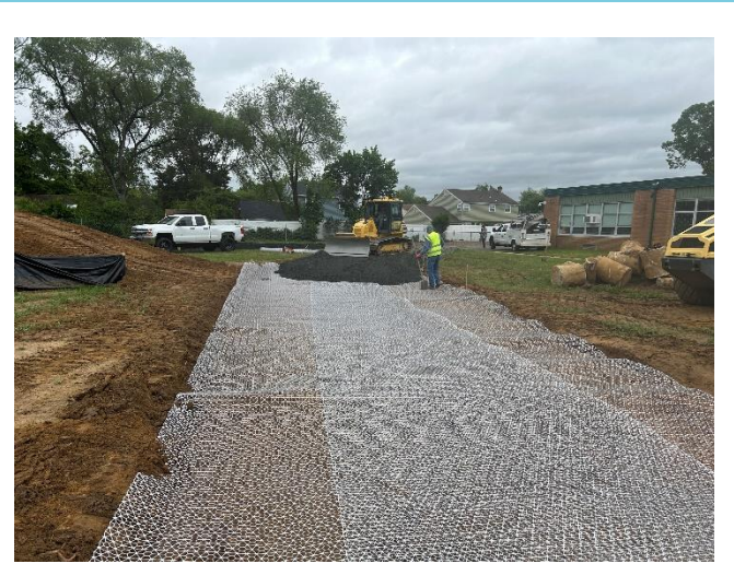
Barton - Geogrid Fabric under access road