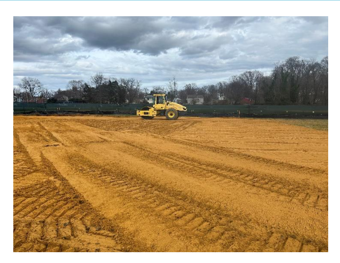
Sharp - constructing building pad