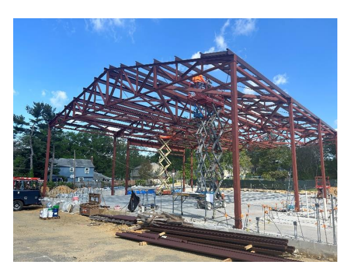
Knight - bolting steel connections