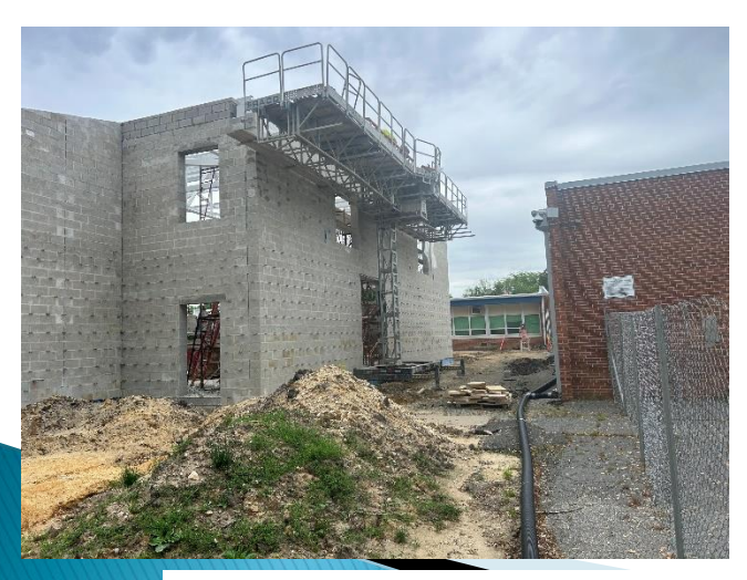
Kingston - CMU walls in progress