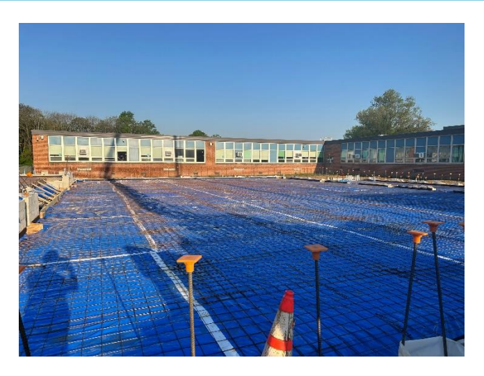
Mann - prep for slab-on-grade