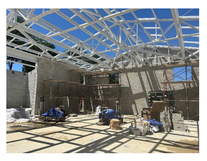
Kingston - CMU walls in progress