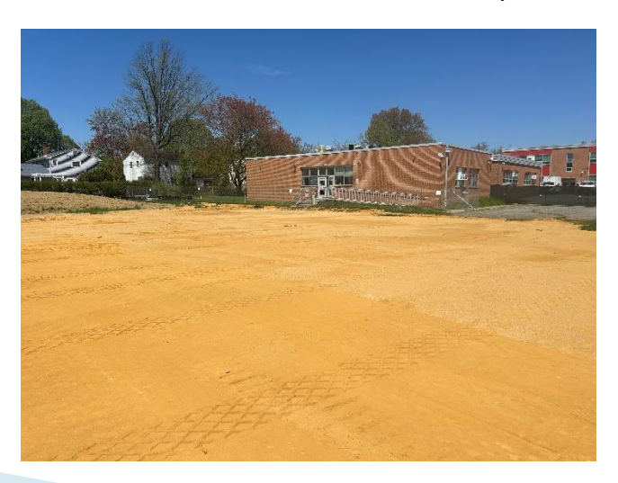
Sharp - building pad complete