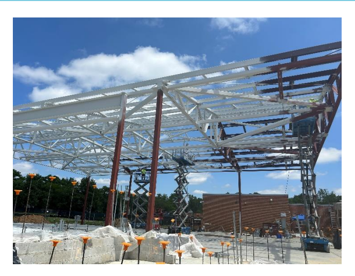
Knight - painting steel structure