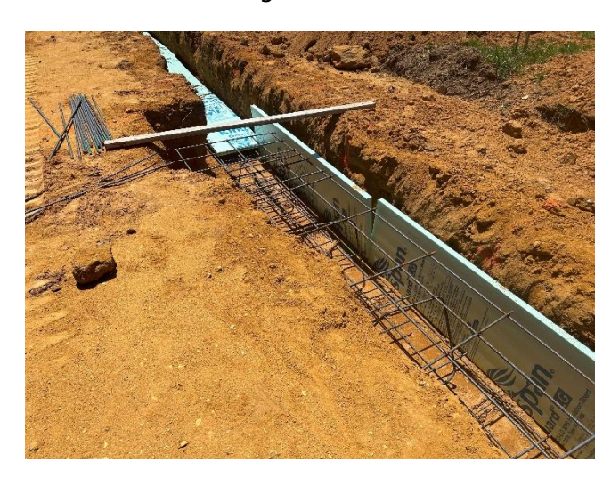
Barton - excavation and rebar for grade beam