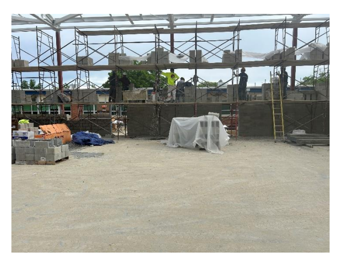
Kingston - CMU walls in progress