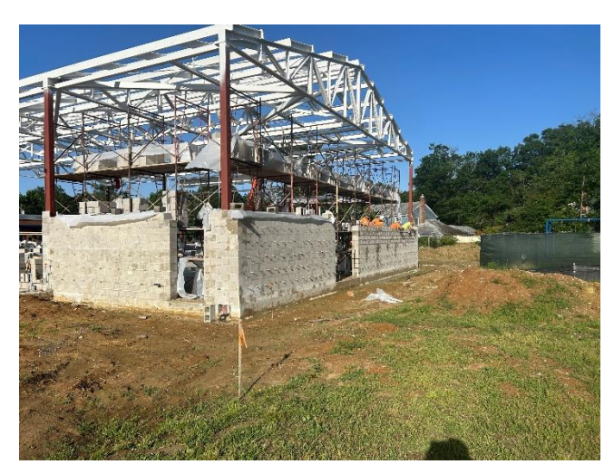
Knight - steel painting and CMU masonry in progress