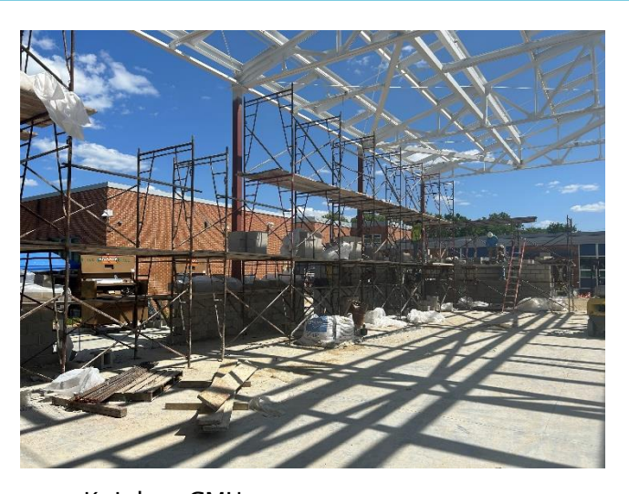
Knight - CMU masonry progress