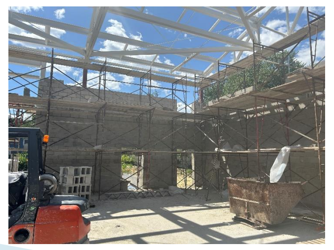
Knight - CMU masonry progress