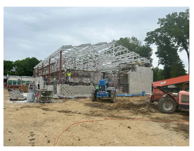
Kingston - CMU walls in progress