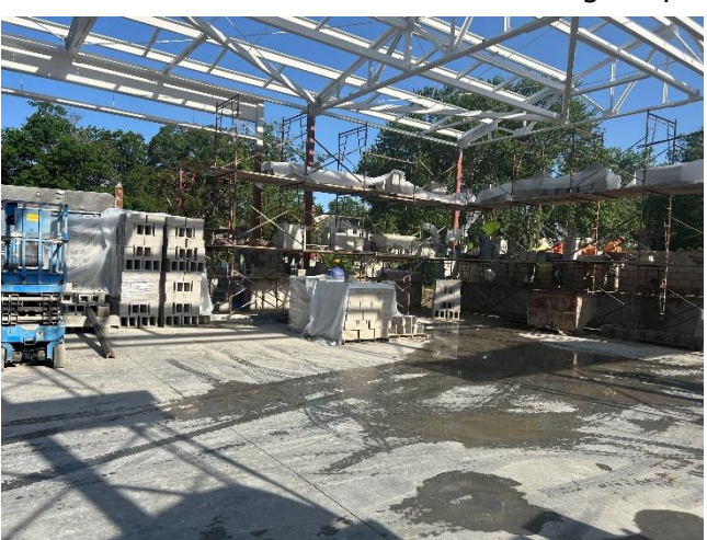
Knight - steel painting and CMU masonry in progress