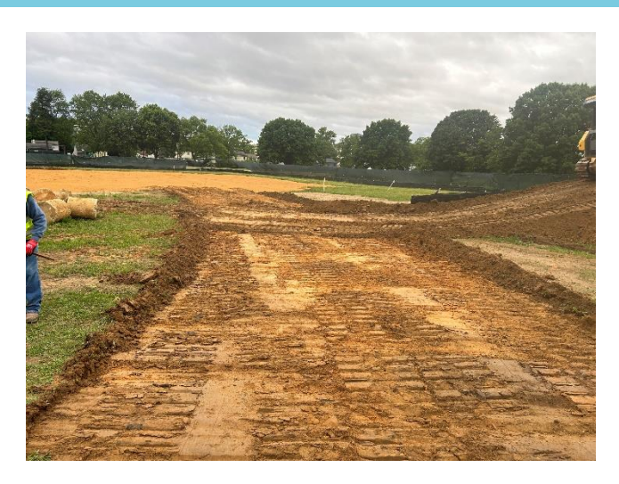
Barton - Stripping Access Road