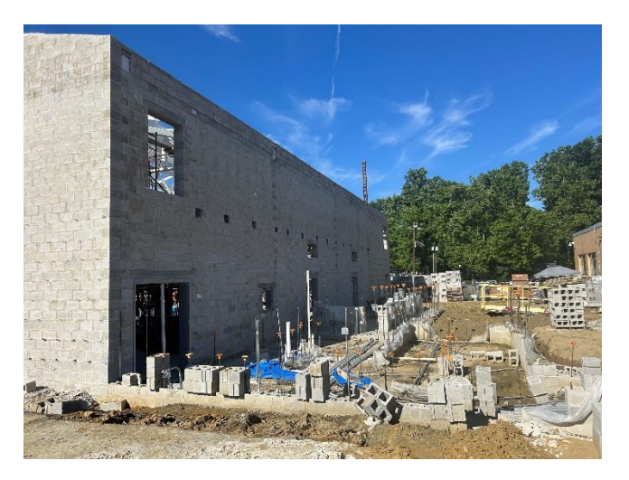
Johnson - block wall construction