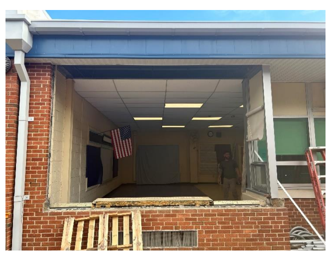
Kingston – demo for connection to existing building

Kingston - brick veneer, beginning wall panels