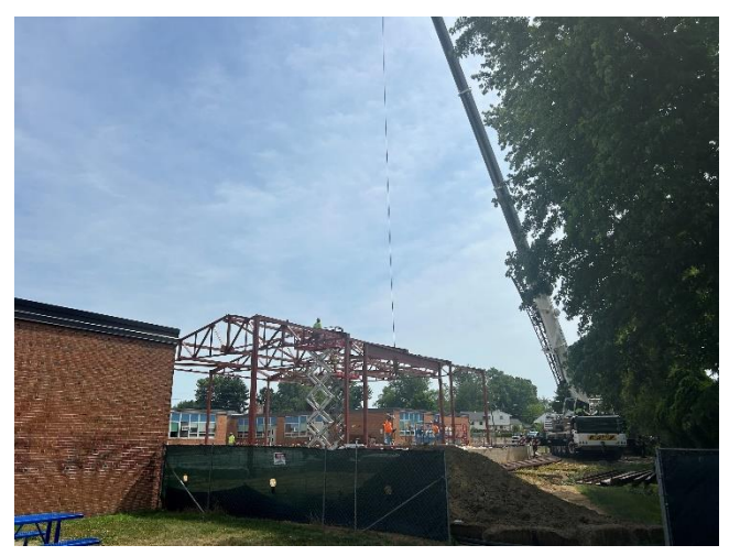
Mann - structural steel erection in progress