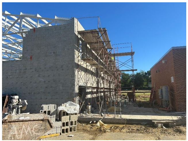
Knight - CMU walls in progress

Knight - infill of existing door openings