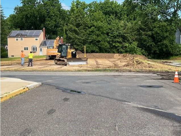
Clearing construction laydown/staging area