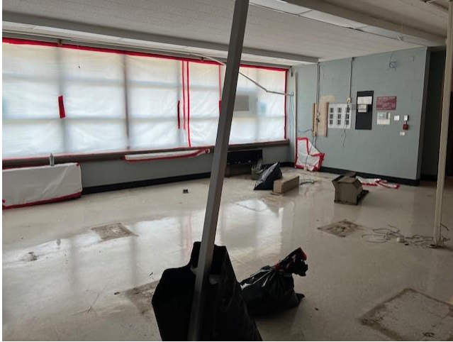
Critical barriers being set up in main office