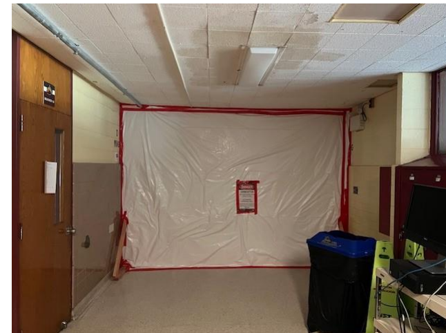
Critical barriers in A wing