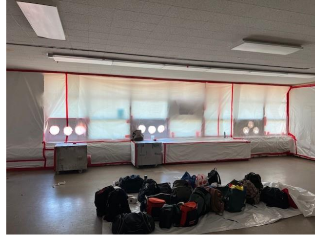
Critical barriers set up in Classroom A4