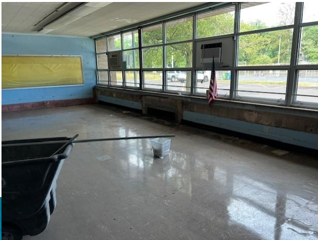
Classroom A-1 interior demo (pre-abatement)