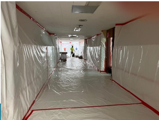
Critical barriers set up in Corridor A