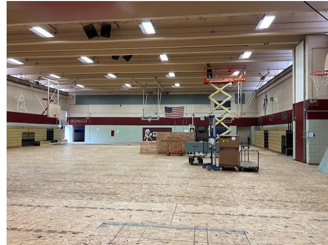
Removal of acoustic panels in gym ceiling