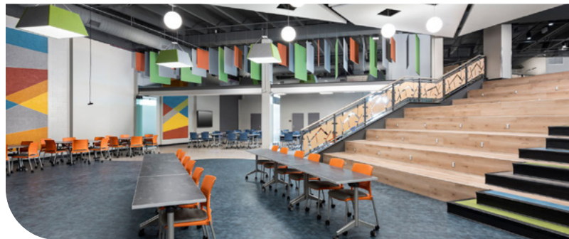
Above: Aspire Innovation Center

For a full summary of DVUSD Bond projects and other financial information , visit the District website at dvUSD.org/Election .