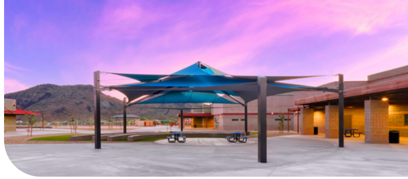
Inspiration Mountain School

See DVUSD's Growth and District Statistics by the Numbers!