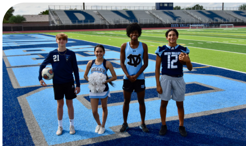
Below: Deer Valley High School new turf field, uniforms, and equipment