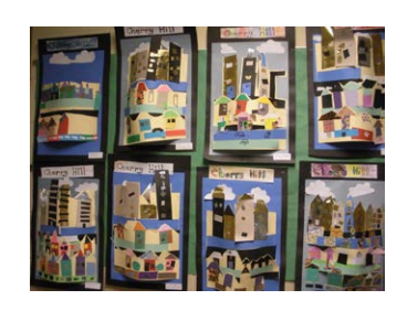
Send Us Your News