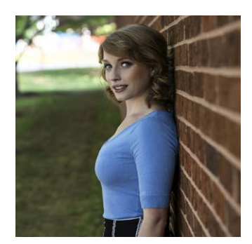
Where Are They Now?

As part of a new way for students in the Cherry Hill Public Schools to have their voices heard and questions answered, Dr.