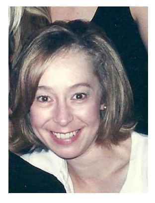
Where Are They Now?

The students of the Beck Middle School Orchestra, pictured above, won first place and